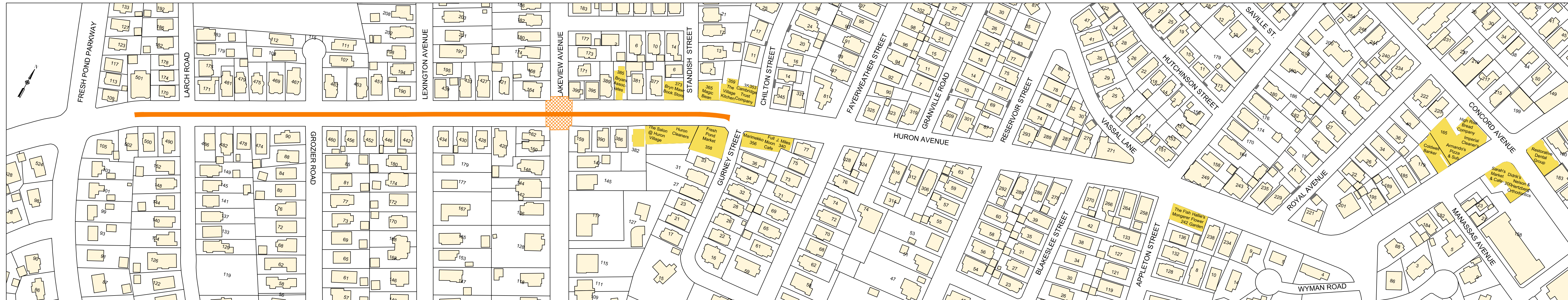
SPRING-SUMMER 2015: COMCAST WORK AND MISCELLANEOUS DRAIN, SEWER AND WATER WORK