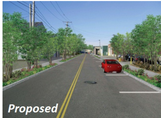
Fawcett Street Improvements Concord Avenue to Smith Place