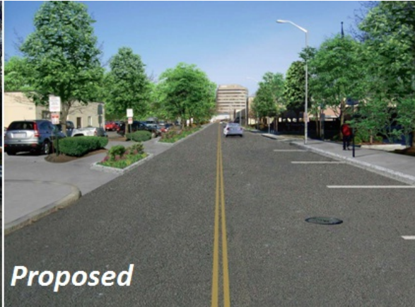
Fawcett Street Improvements Concord Avenue to Smith Place