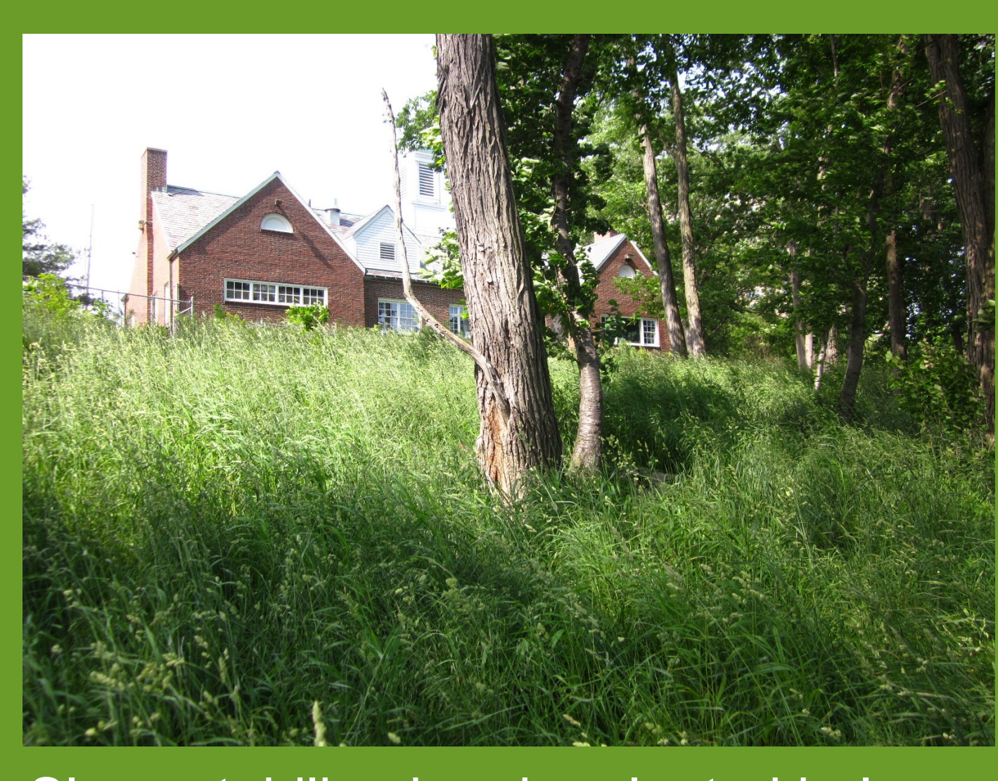
Slope stabilized and replanted below the golf course club house