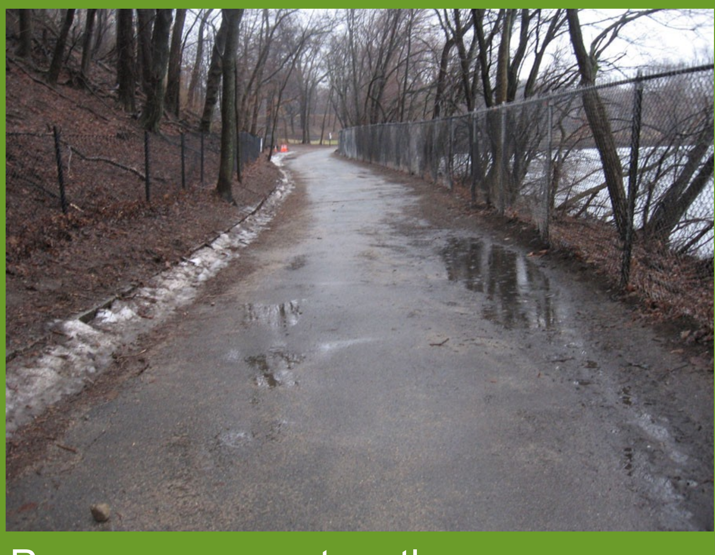
Porous pavement on the Perimeter Road will improve drainage