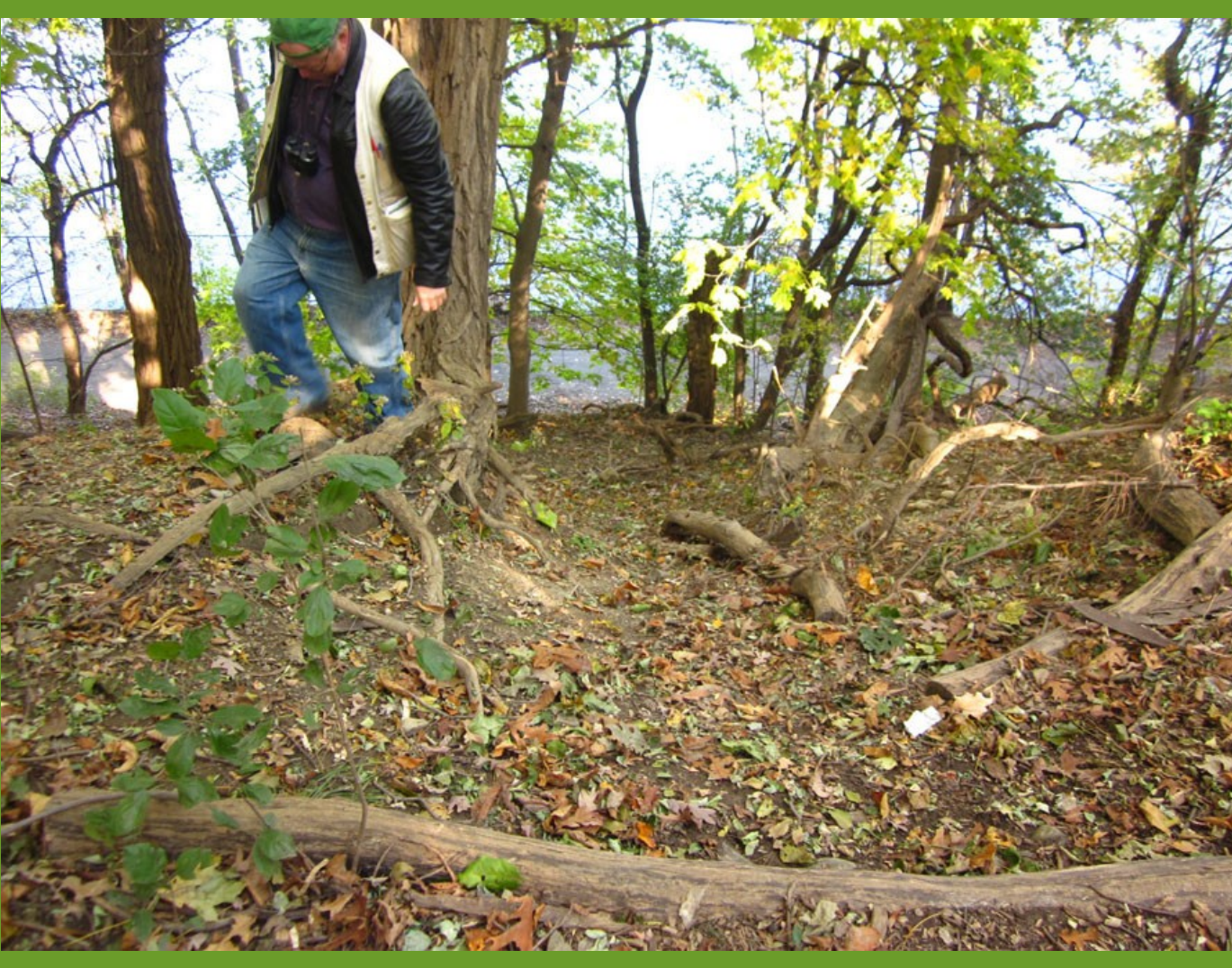
Gullies cause sediment to accumulate at toe of slope

Renovation and reconstruction of Glacken Slope enhancing ecological structure and user experience