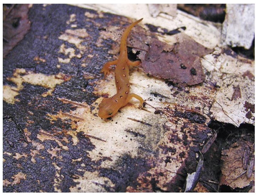
During their terrestrial juvenile—or "red eft"—phase, eastern red-spotted newts are ten times more toxic than during their aquatic adult phase. They are often seen foraging in forests adjacent to breeding ponds.

Another commonly observed species in Massachusetts is the eastern red-spotted newt (Notophthalmus viridescens), the state's lone representative of Salamandridae. While this species is aquatic both as larva and adult, it also has a terrestrial juvenile, or "red eft," phase that lasts from two to seven years. As a deterrent to potential predators, red efts are equipped with toxic chemicals in their skin similar to those produced by puffer fish. Consequently, on days that are wet enough to keep their skin moist, they are able to forage in the open without fear of predation—often in such abundance as to make hikers fear stepping on one by accident.