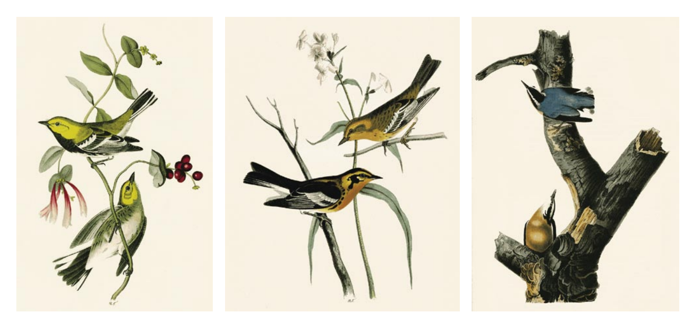
Left to right, the black-throated green warbler, blackburnian warbler, and red-bellied nuthatch drawn and published by John James Audubon in Birds of America, vol. ii, 1841, and vol. iv, 1844.

forests have less snow cover than hardwood stands. In my 2003–2004 study conducted at the Harvard Forest I found higher red-back salamander abundance in eastern hemlockdominated stands than in hardwood stands. A follow-up study conducted throughout northcentral Massachusetts found no difference in red-back abundance in the two forest types, but the populations in hemlock-dominated forests did contain a higher percentage of larger individuals than populations in hardwood stands.