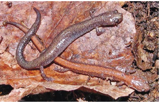
Red-back salamanders occur most commonly in two color morphs, the leadback morph and the striped morph. The percentage of leadback morphs in redback salamander populations increases with warmer temperatures.

Ten salamander species from three families are found naturally in Massachusetts. (In addition, one species from a fourth family, the mudpuppy ( Necturus maculosus ), was introduced into the Connecticut River, probably late