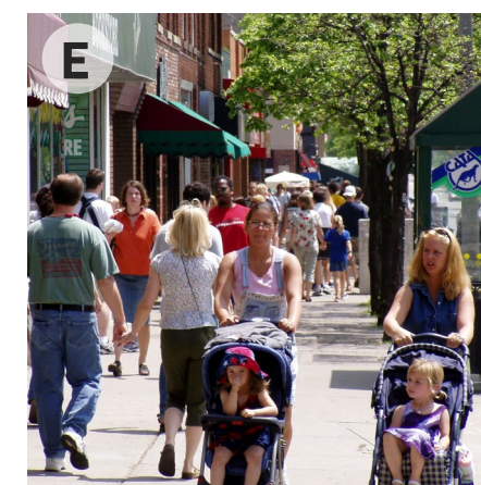
Example Wide Sidewalk