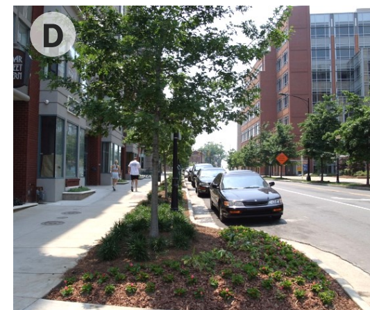
Example Curb Extension with Landscaping