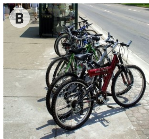
Example Bike Parking