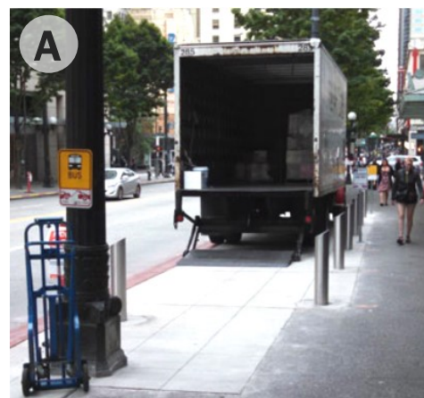
Example Loading Area