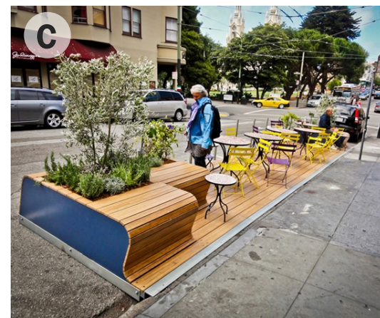
Example Parklet with Seating