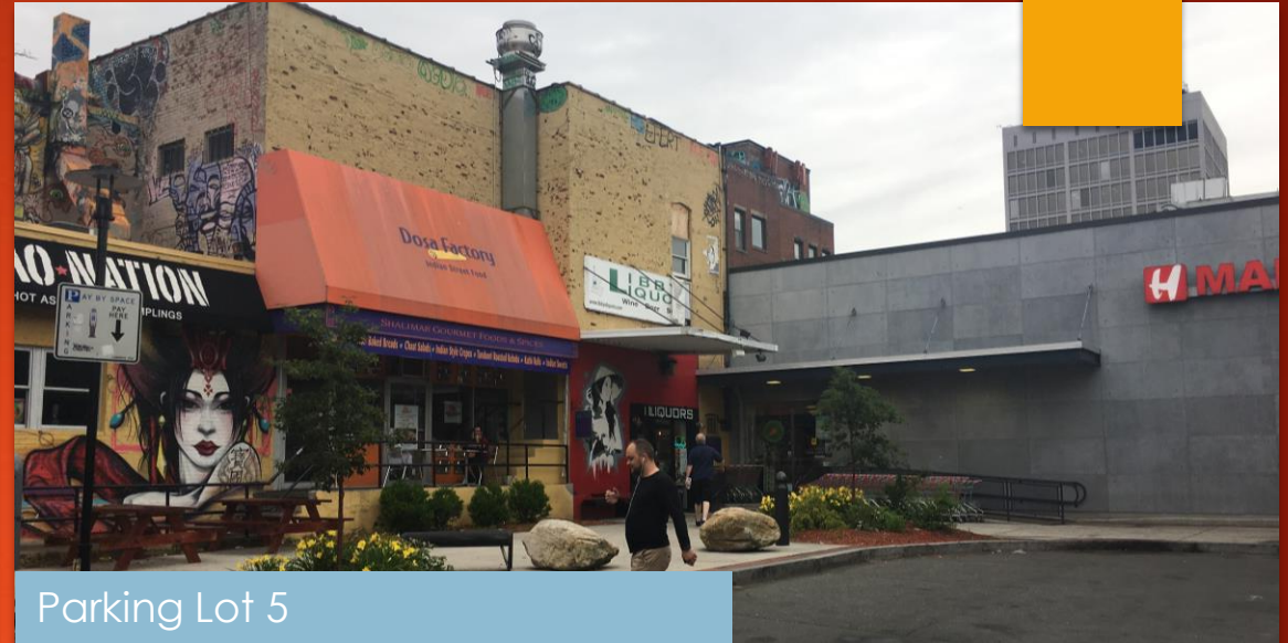
Parking Lot 5