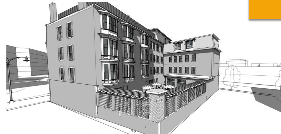
② COURTYARD VIEW