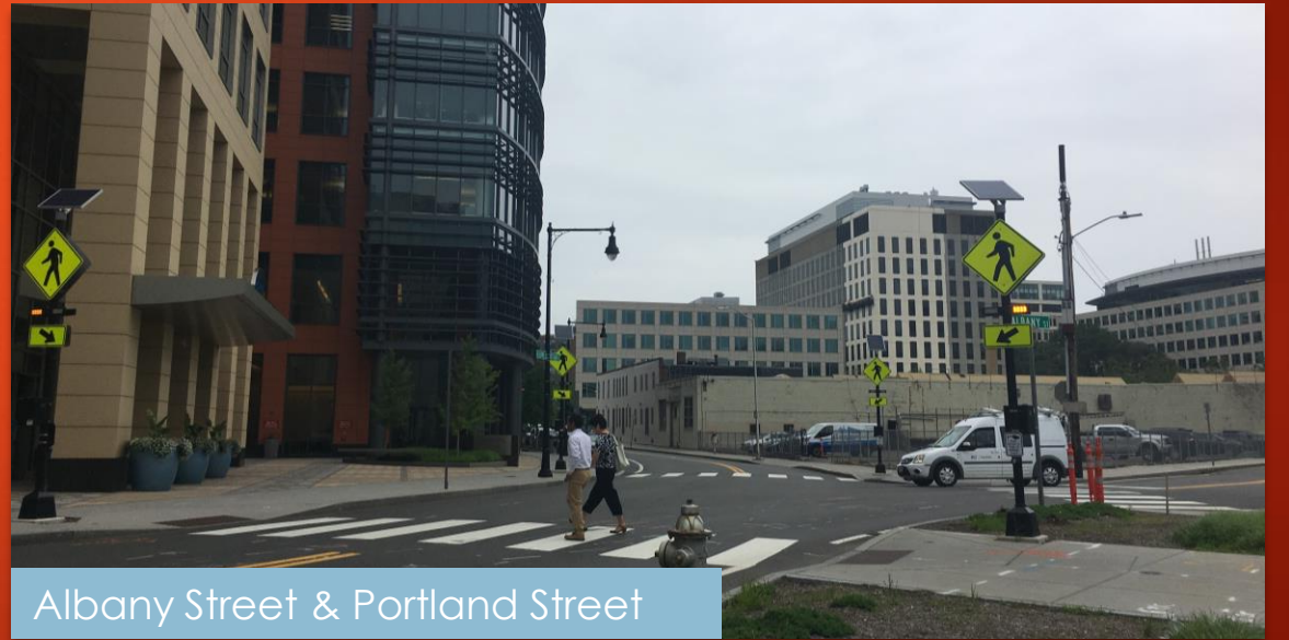
Albany Street & Portland Street