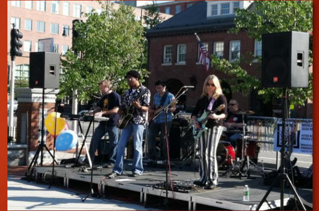
Dance Party, Taste of Cambridge, 2015 River Festival