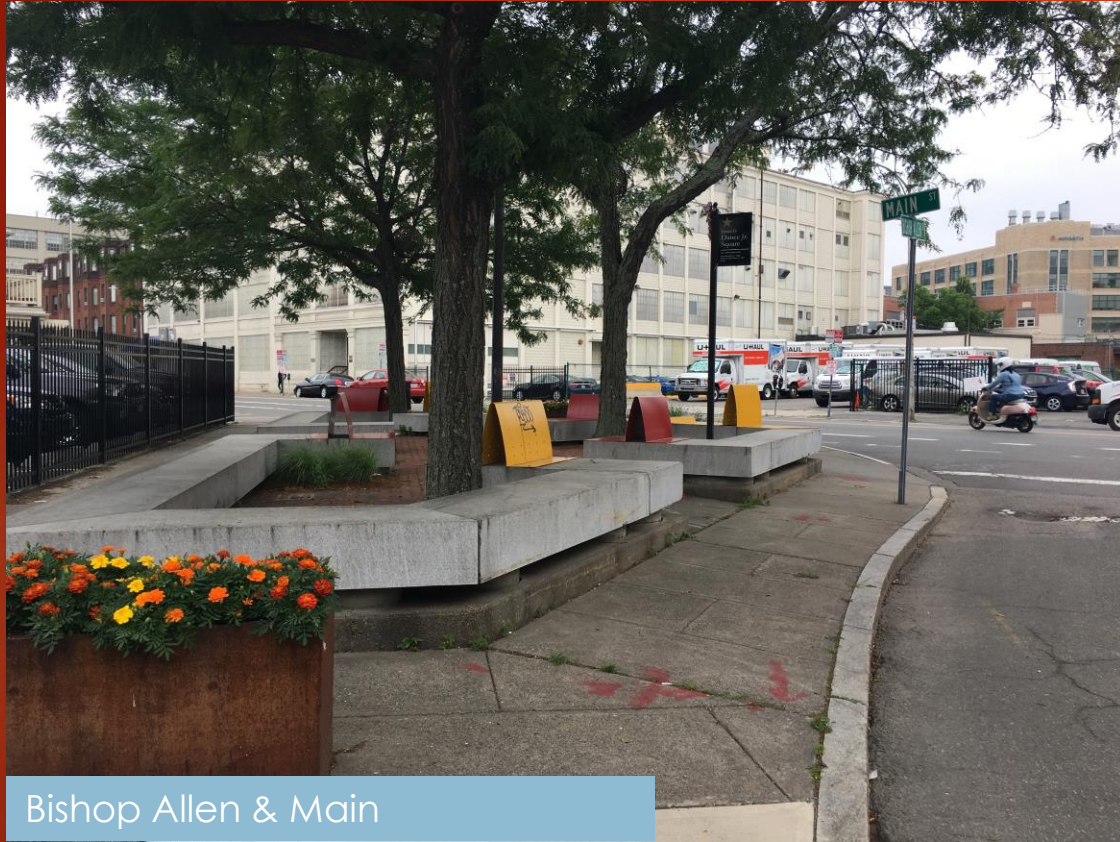
Bishop Allen & Main