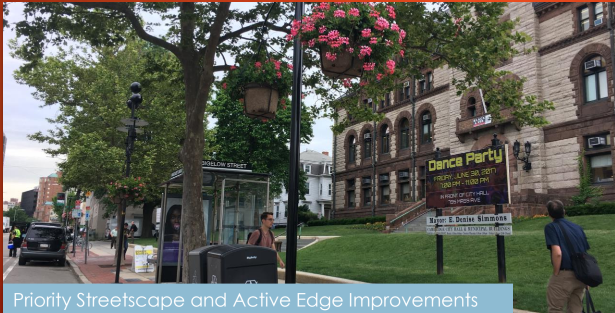
Priority Streetscape and Active Edge Improvements