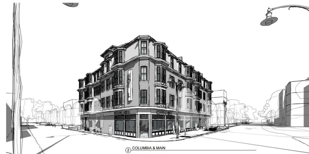
② COLUMBIA & MAIN