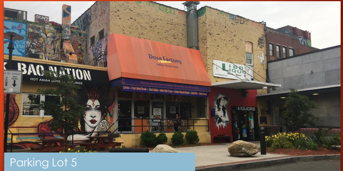
Parking Lot 5