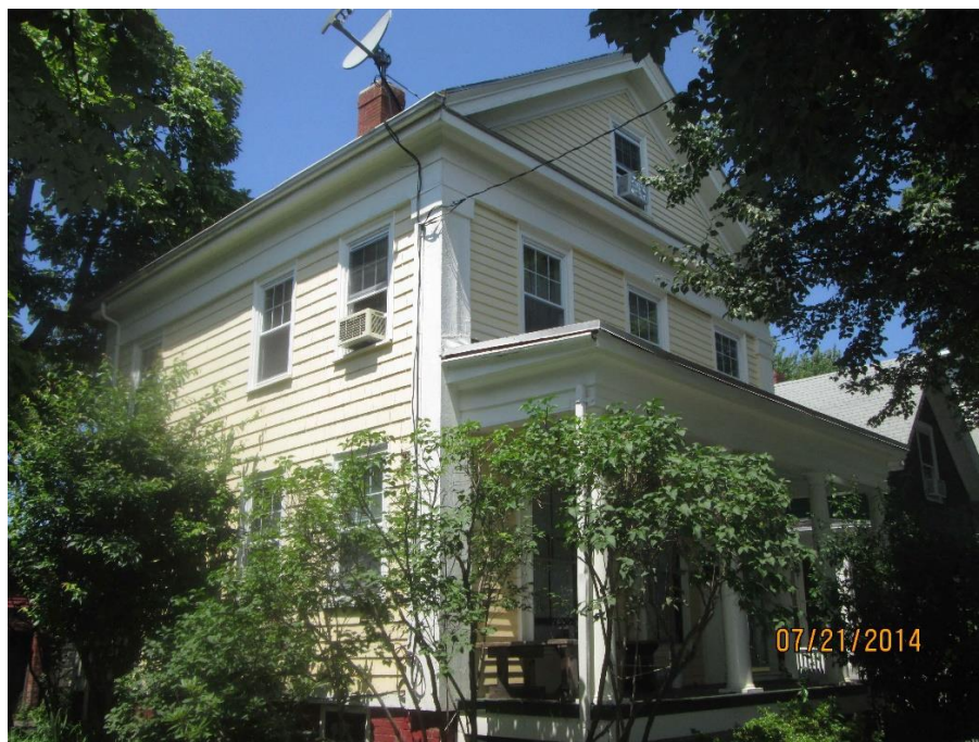
41 Tremont Street

An application to relocate the house at 41 Tremont Street on its lot was received on December 13, 2019. The owner, 41 Tremont St. Ventures LLC, was notified of an initial determination of significance and a public hearing was scheduled for January 2, 2020. The outbuilding at the rear of the lot was determined not to be significant.