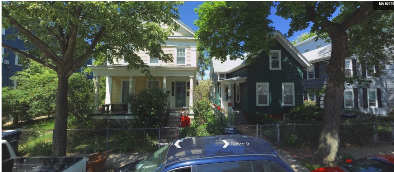
41 Tremont Street (yellow house at left) Cambridge