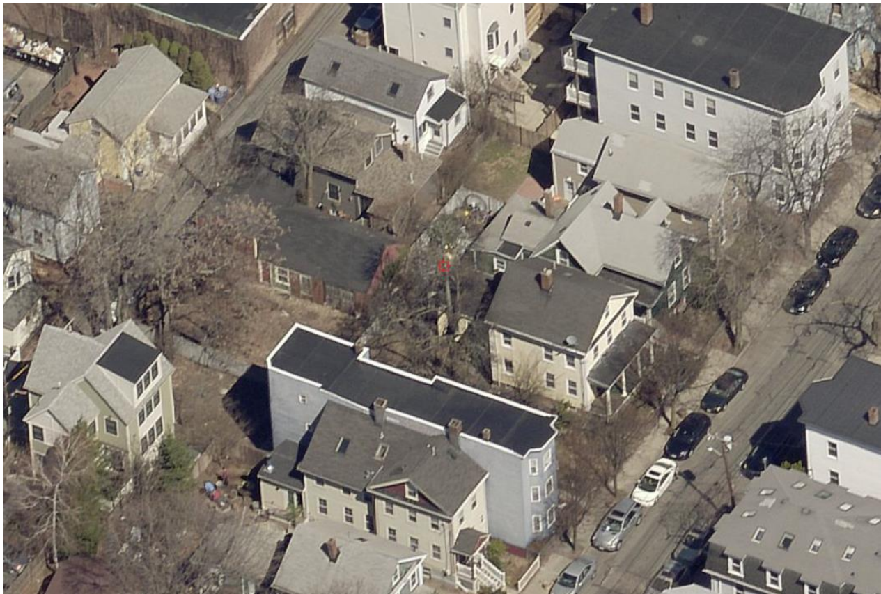
41 Tremont Street, Cambridge