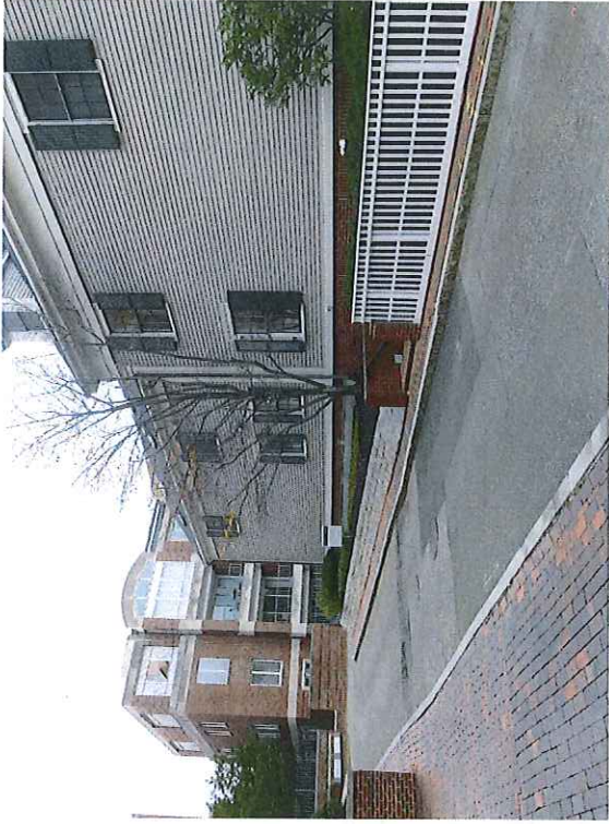
① Existing Conditions - East Elevation