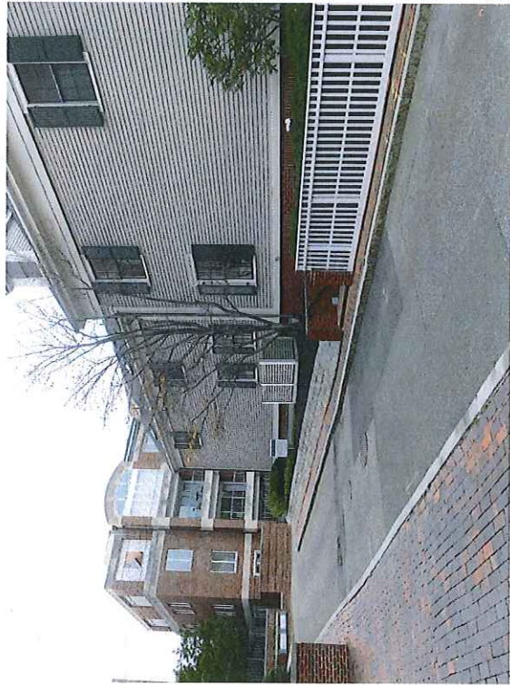
② Proposed Rendering - Equipment Pad & Enclosure