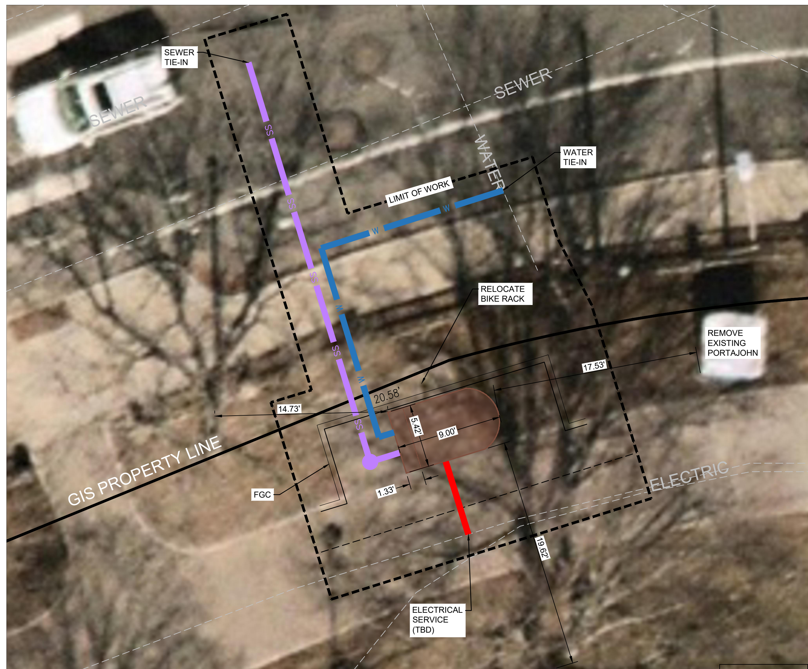
CAMBRIDGE COMMON PORTLAND LOO SCALE: 1" = 5'