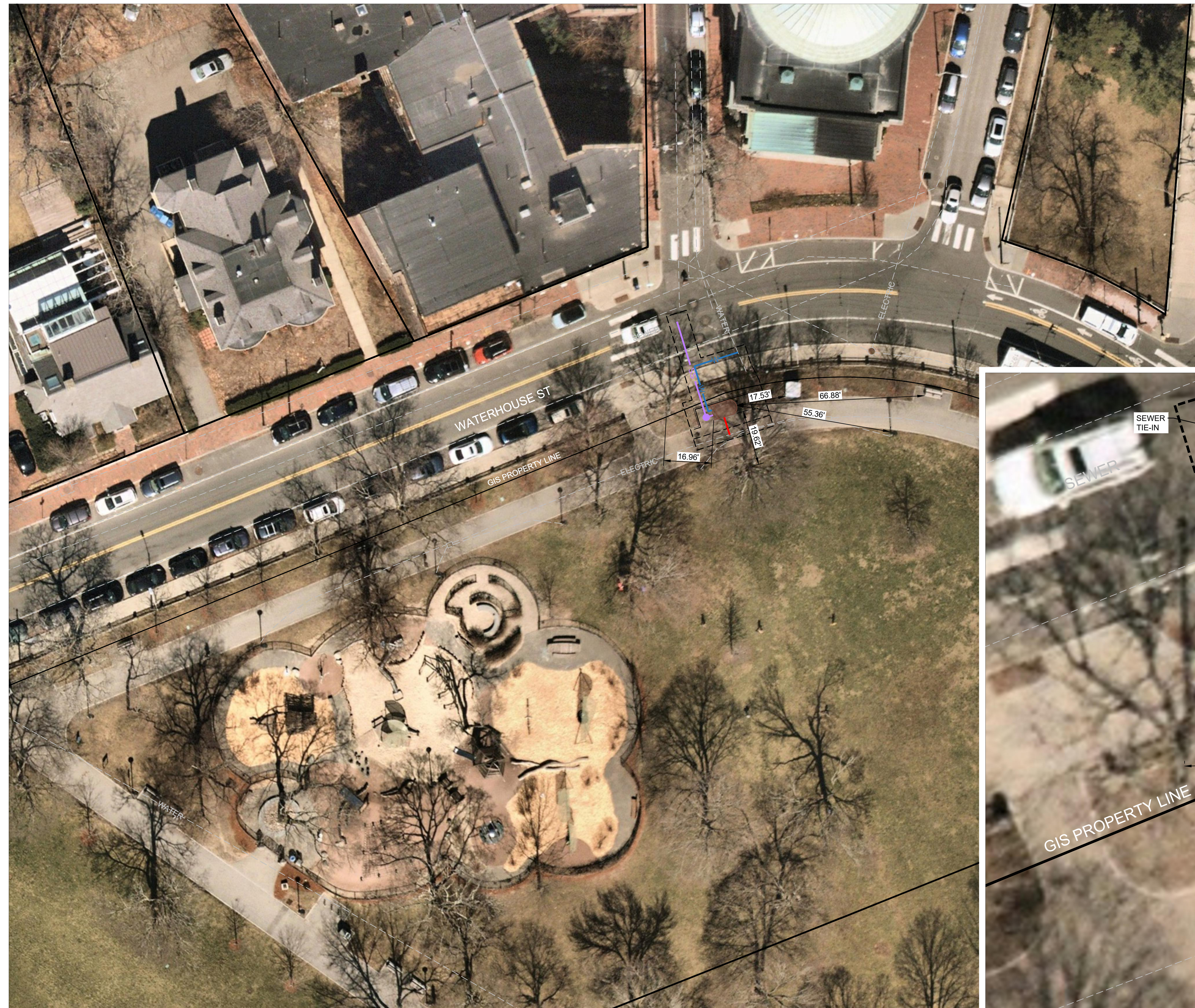
CAMBRIDGE COMMON PORTLAND LOO SCALE: 1" = 20'

CAD FILE: C:\Users\kbrecht\OneDrive - Stantec\Cambridge_Portland_Loo0_Current\CAMBRIDGE_SKETCH.dwg LAYOUT: Option 1 (2) BY: brecht, kaly