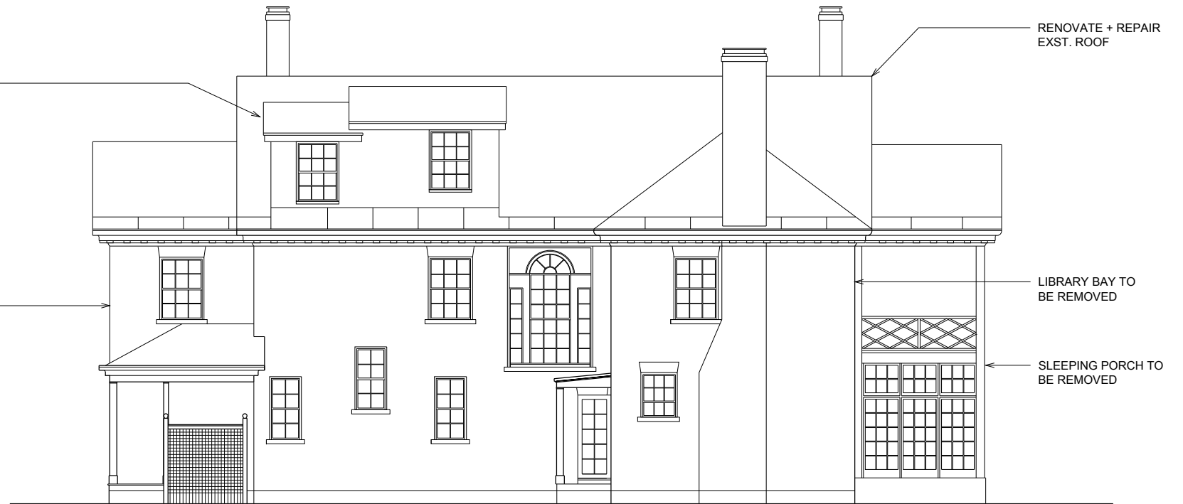
2 NORTH ELEVATION