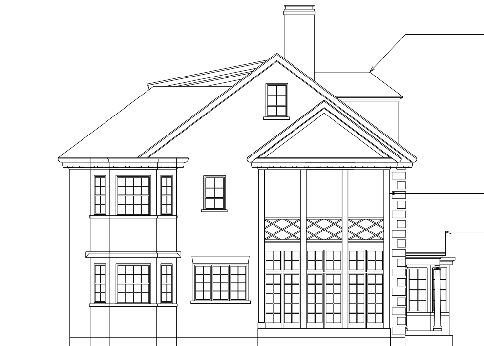
3 WEST ELEVATION