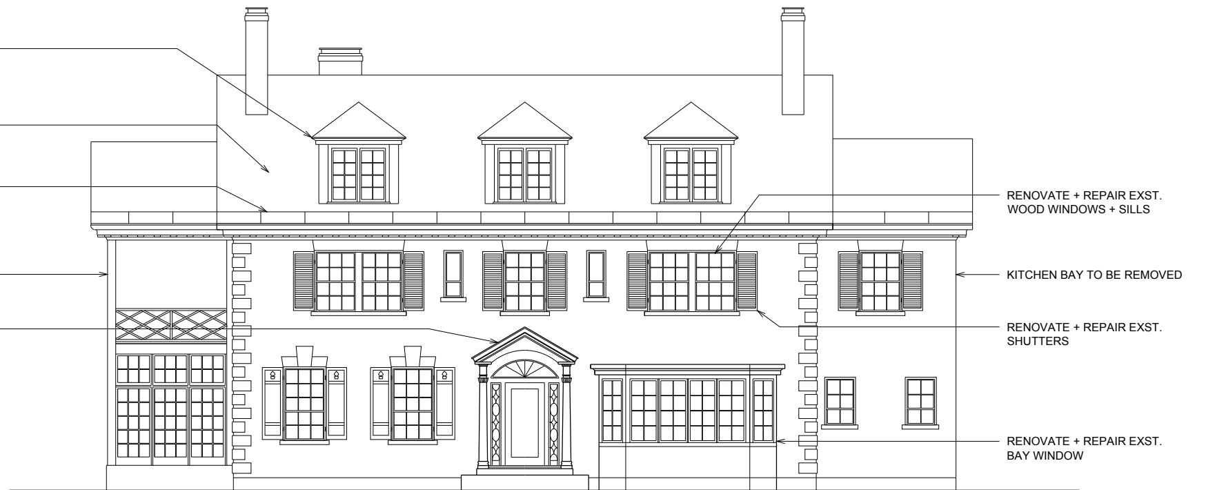
1 SOUTH ELEVATION