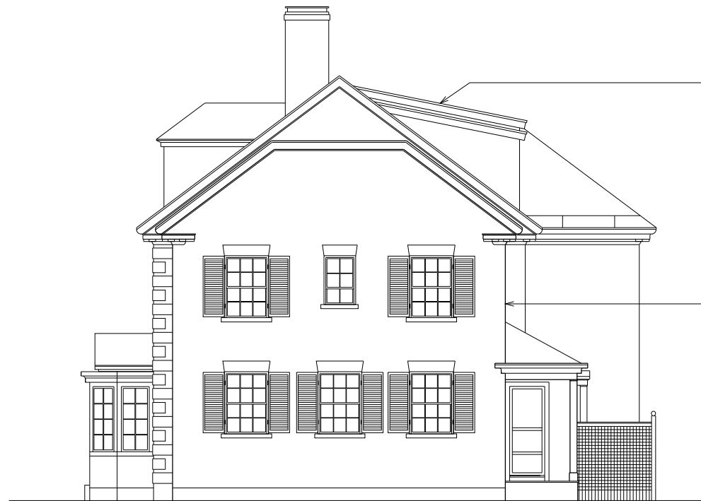
4 EAST ELEVATION