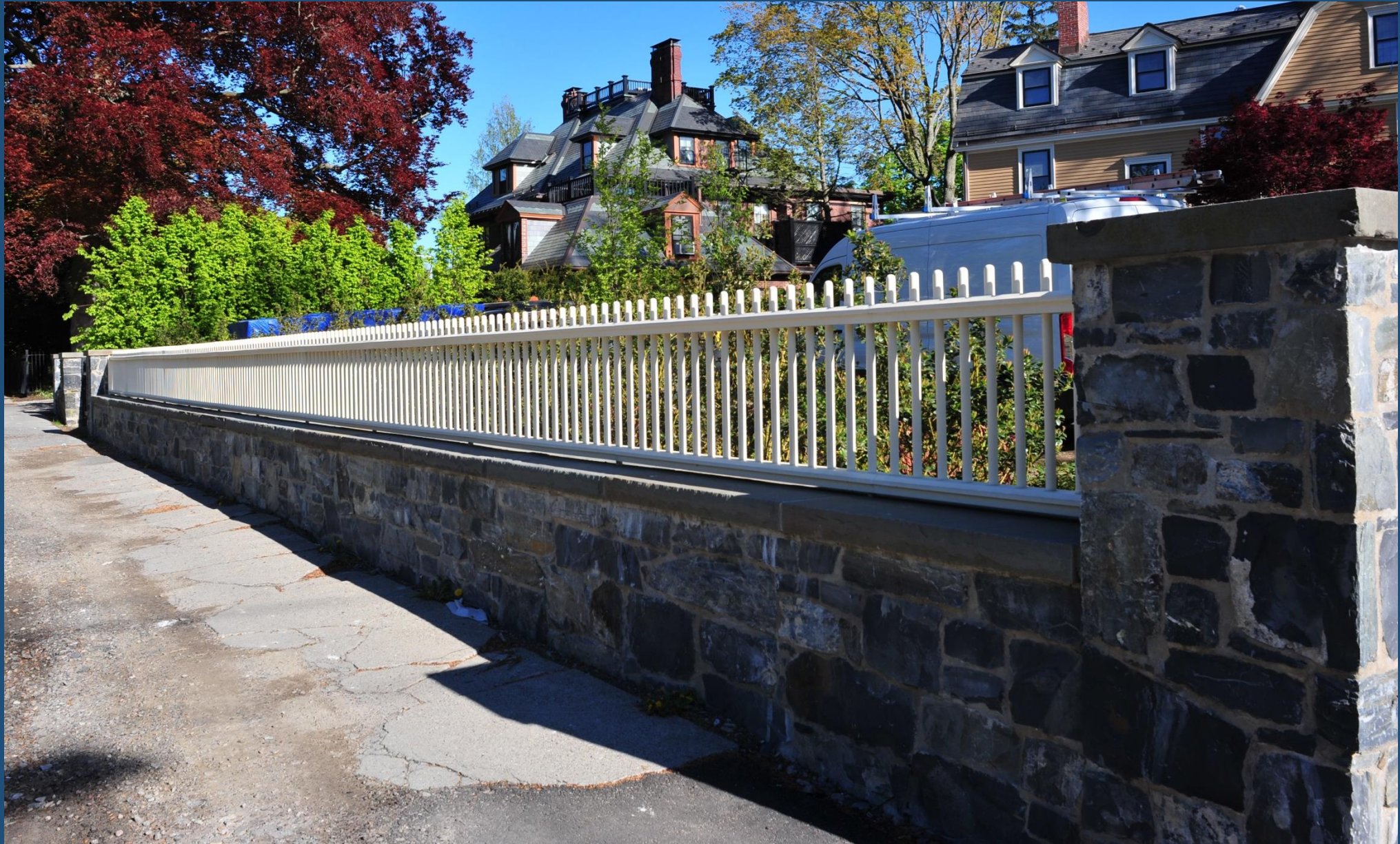
28 Fayerweather Street