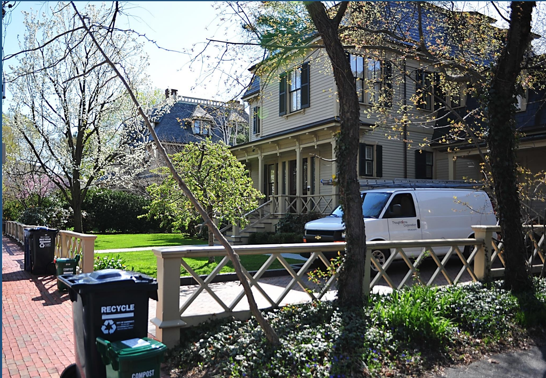
8 Follen Street (1872) with replica wood fence (ca. 1991), May 2018