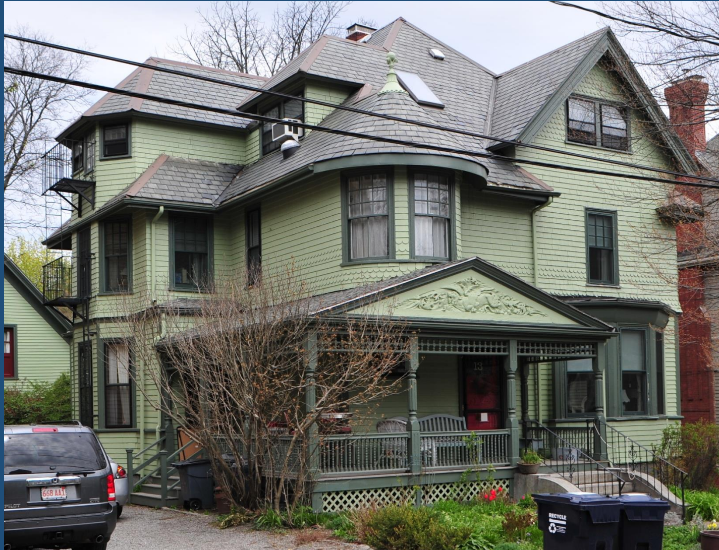
13 Lancaster Street (1885). Avon Hill Neighborhood Conservation District. Slate roof, K-Style gutters and bare fascia. Photo 2016.