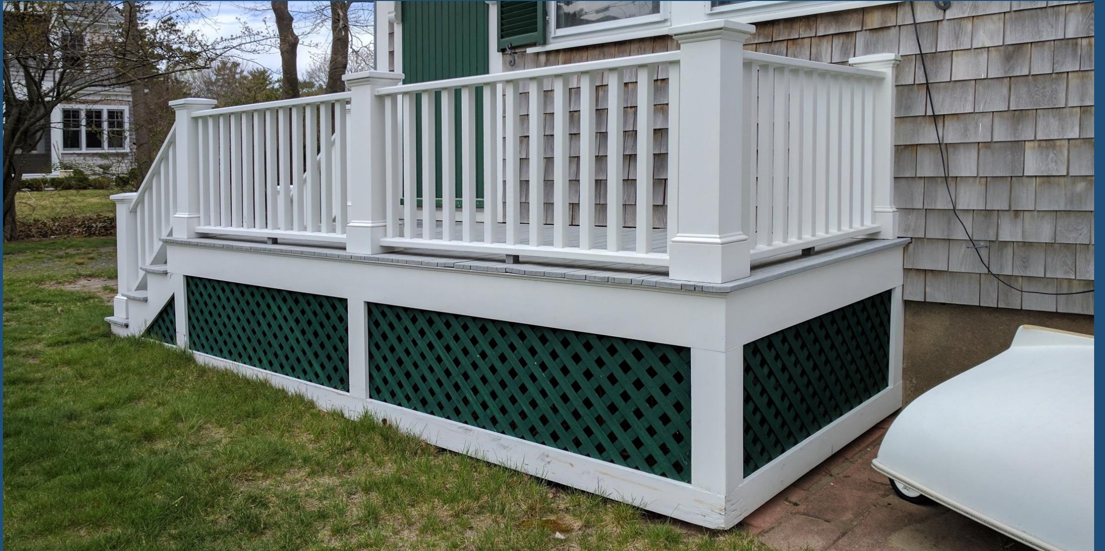
Duxbury, Mass. Deck and railing built with wood in 2010, partially replaced with PVC 2015. Photo 2016.