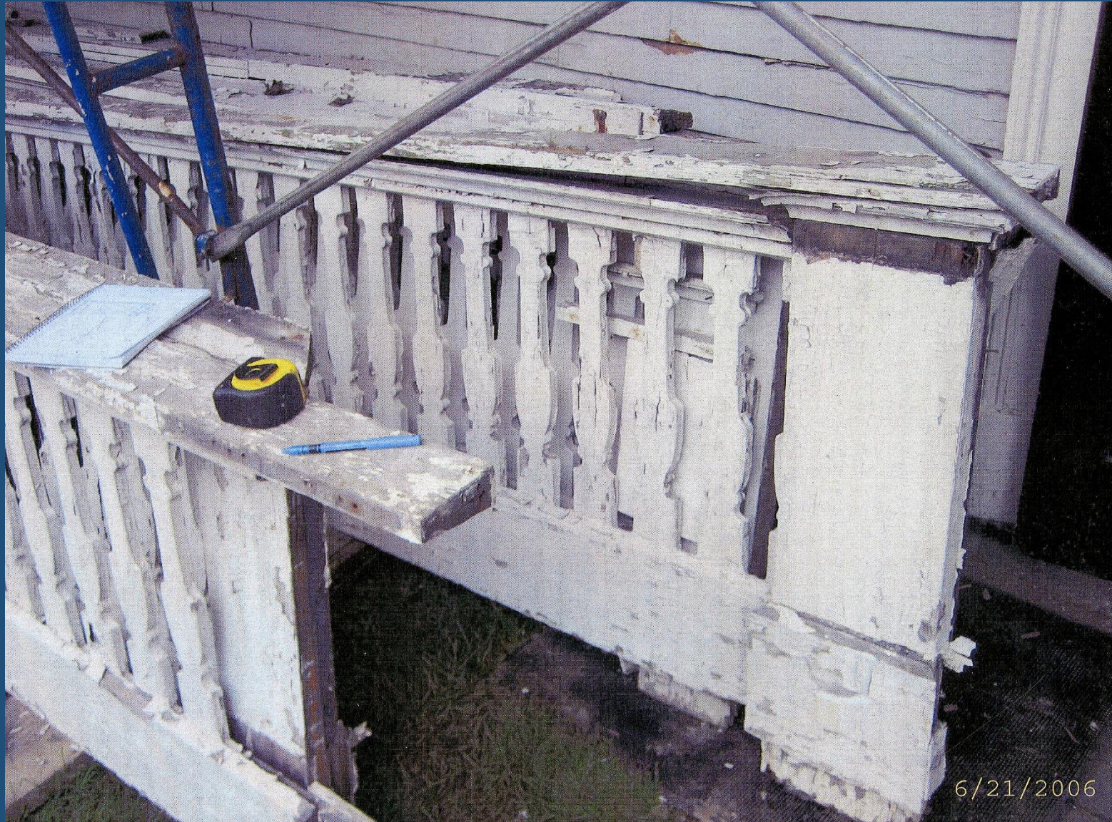
Dana Palmer balustrade in 2006.