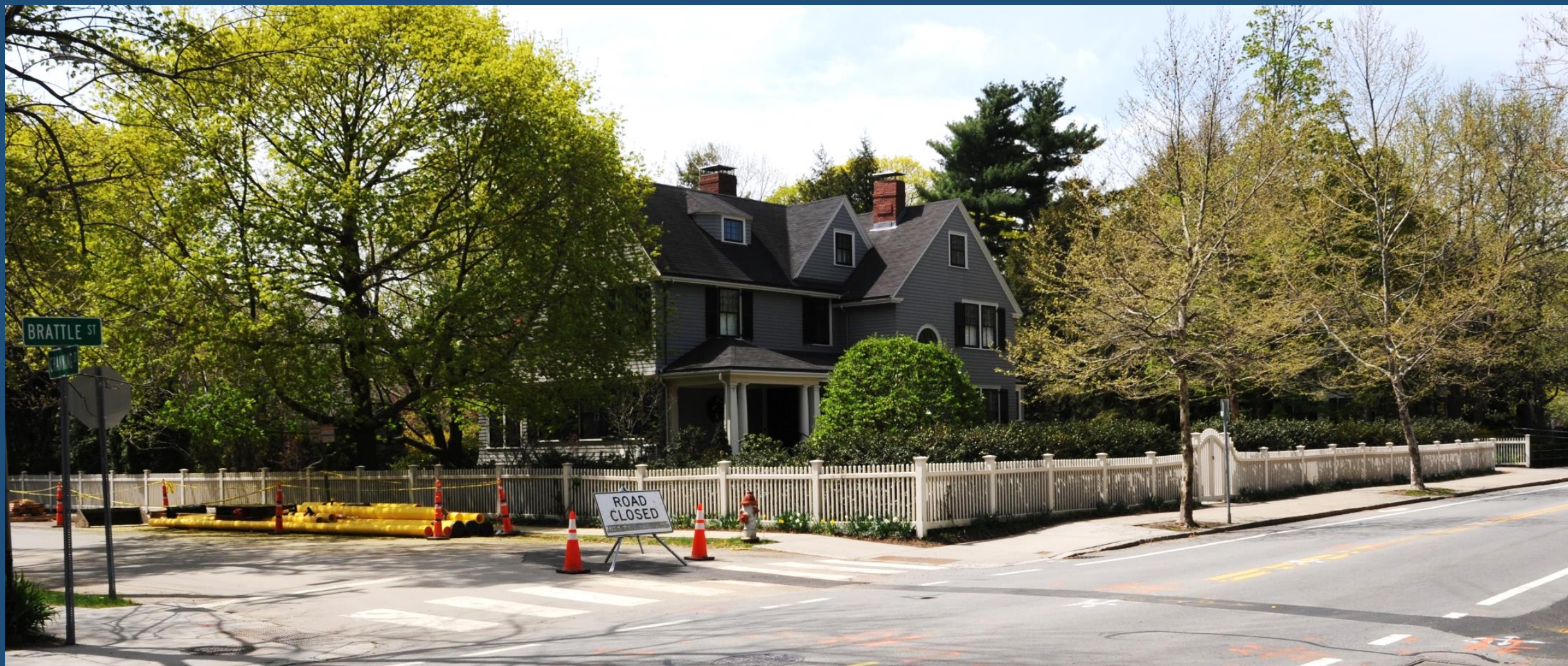
394' of wood fence installed with a Certificate of Appropriateness in 2003. Photo 2015.