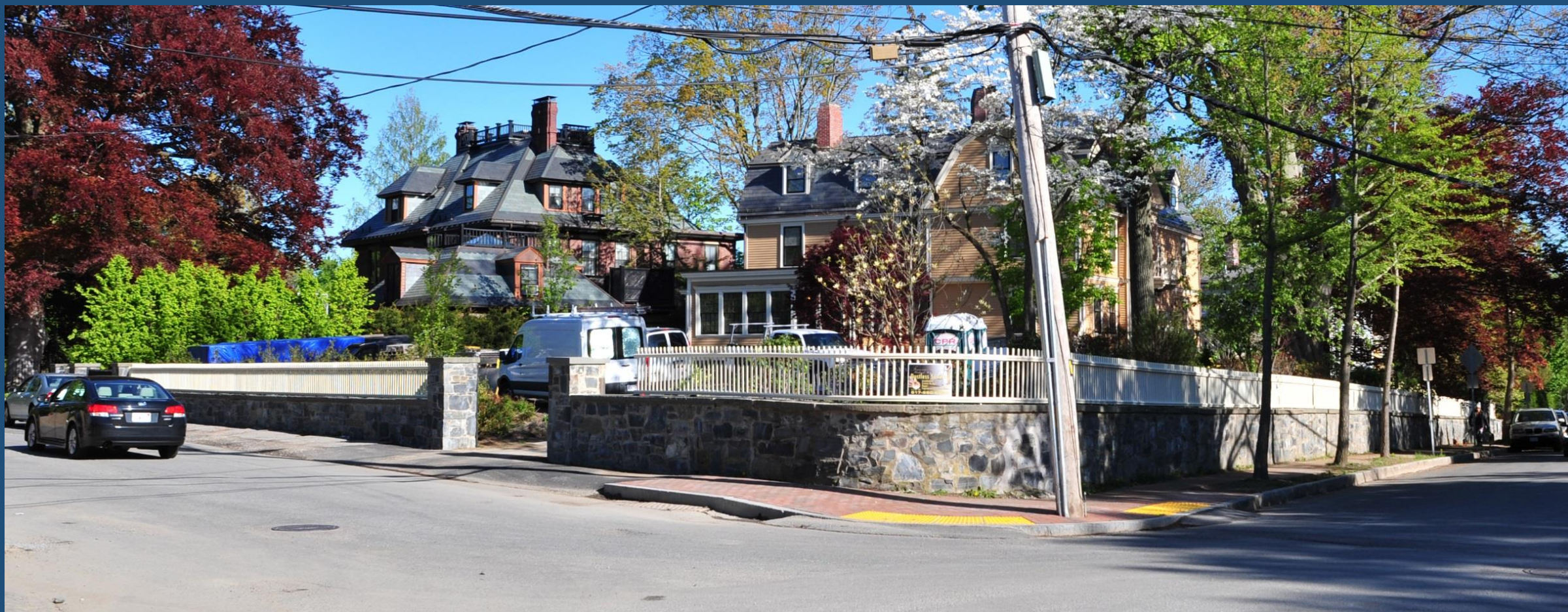
28 Fayerweather Street (1882, Sturgis & Brigham, architects). Cambridge Landmark. 350' fence reproduced from historic photographs.