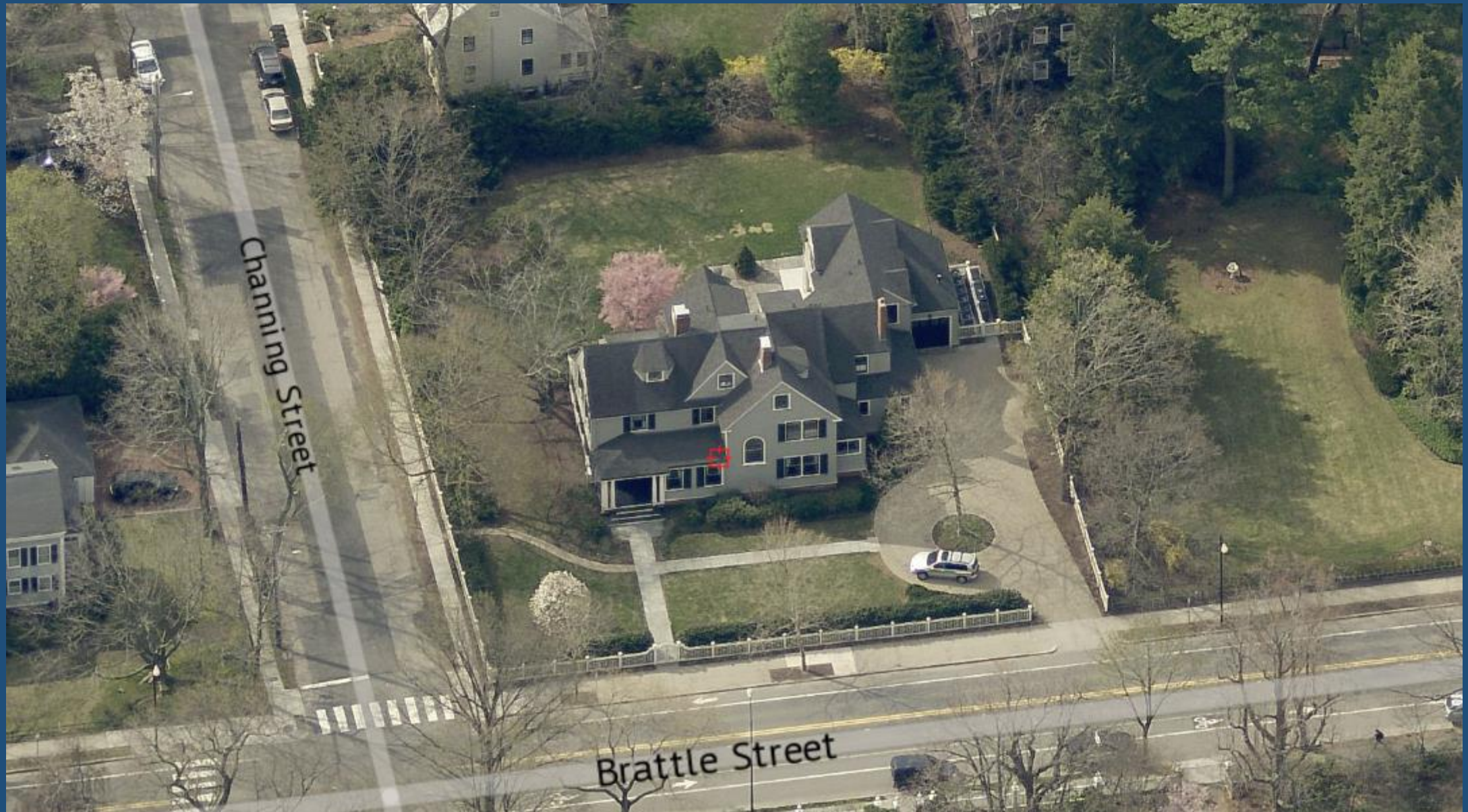
174 Brattle Street, Old Cambridge Historic District