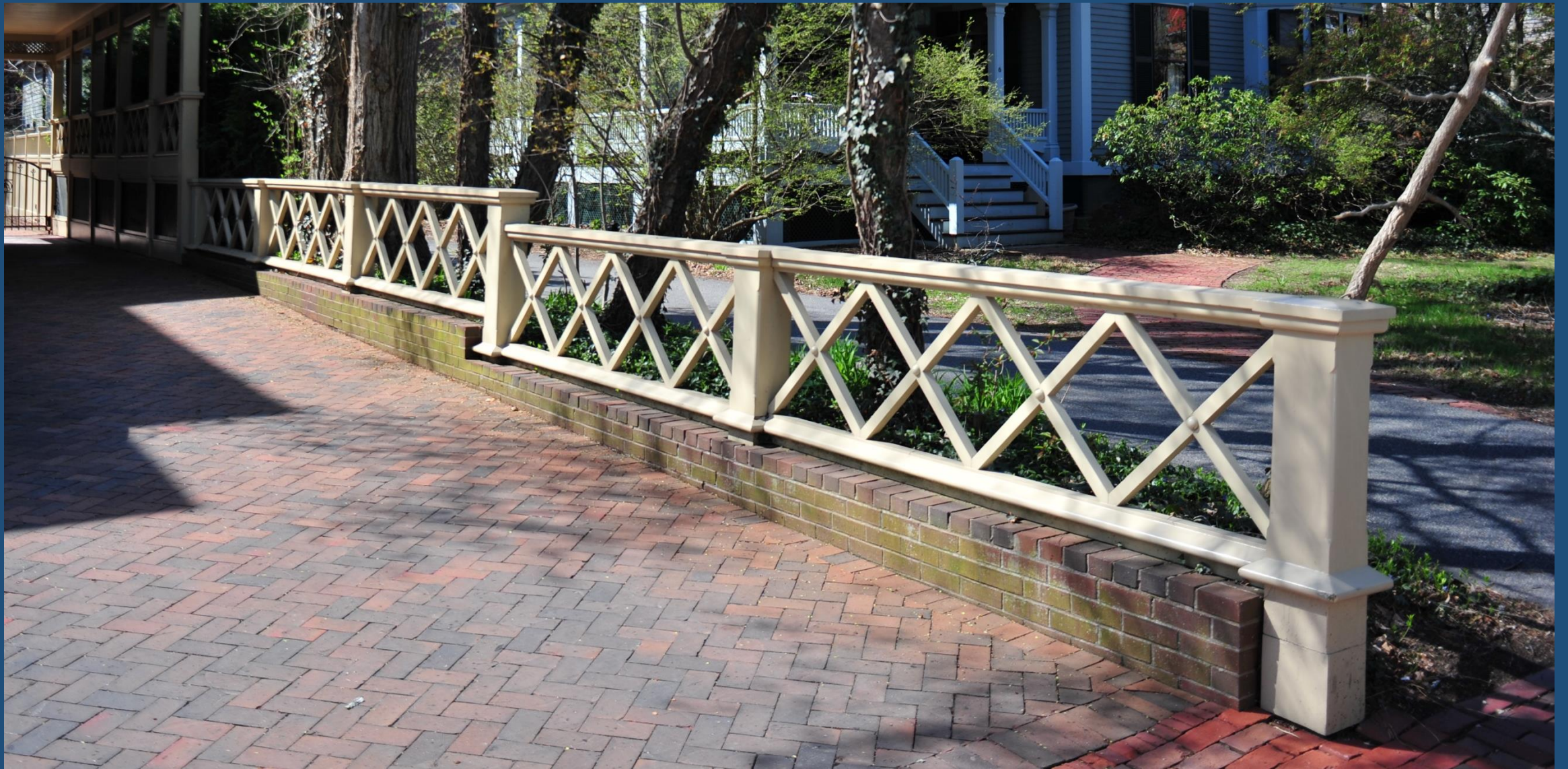
8 Follen Street (1872) with replica wood fence (ca. 1991), May 2018