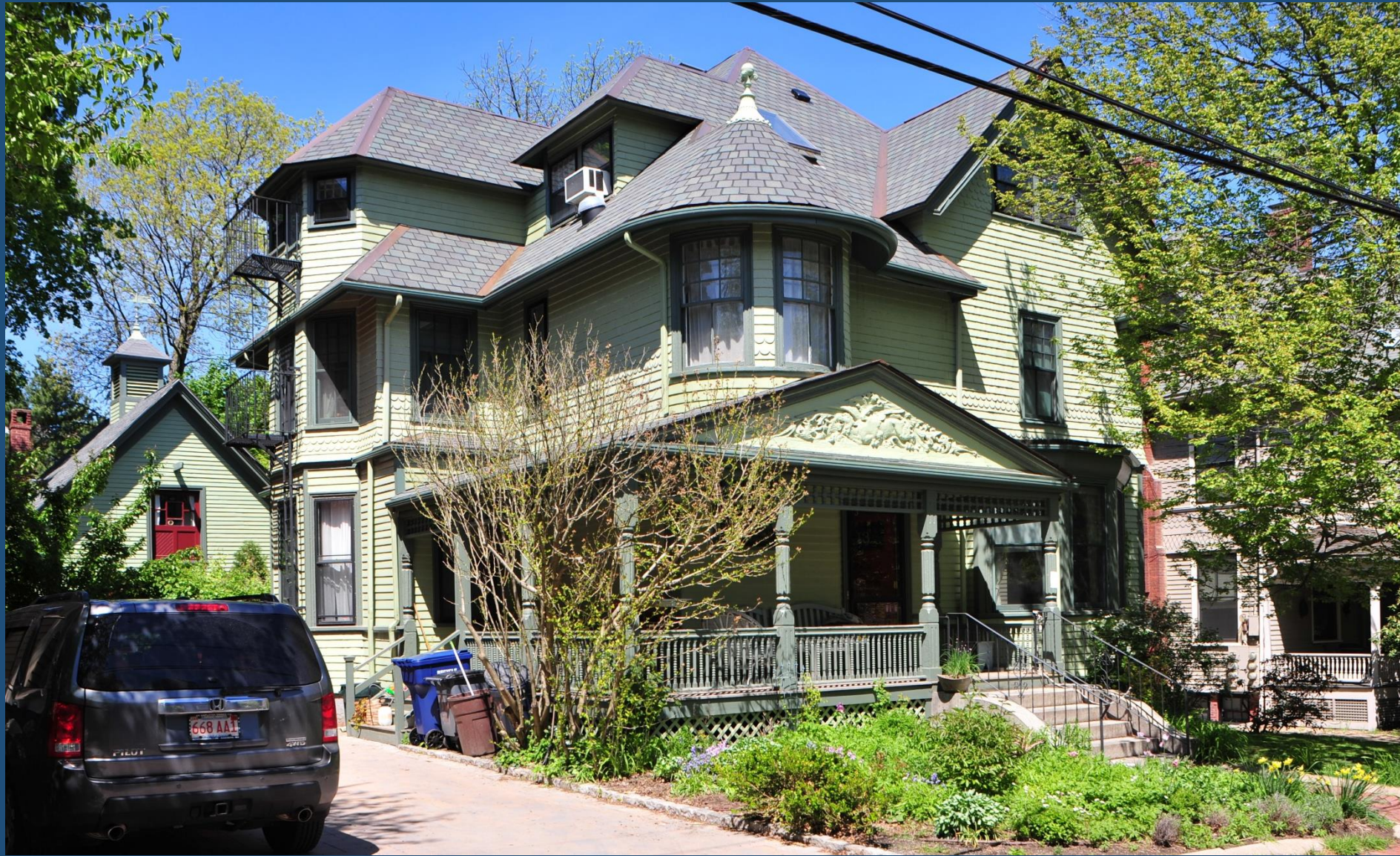
Asphalt shingles with custom-made curved fiberglass gutter, 2016. Photo 2017.