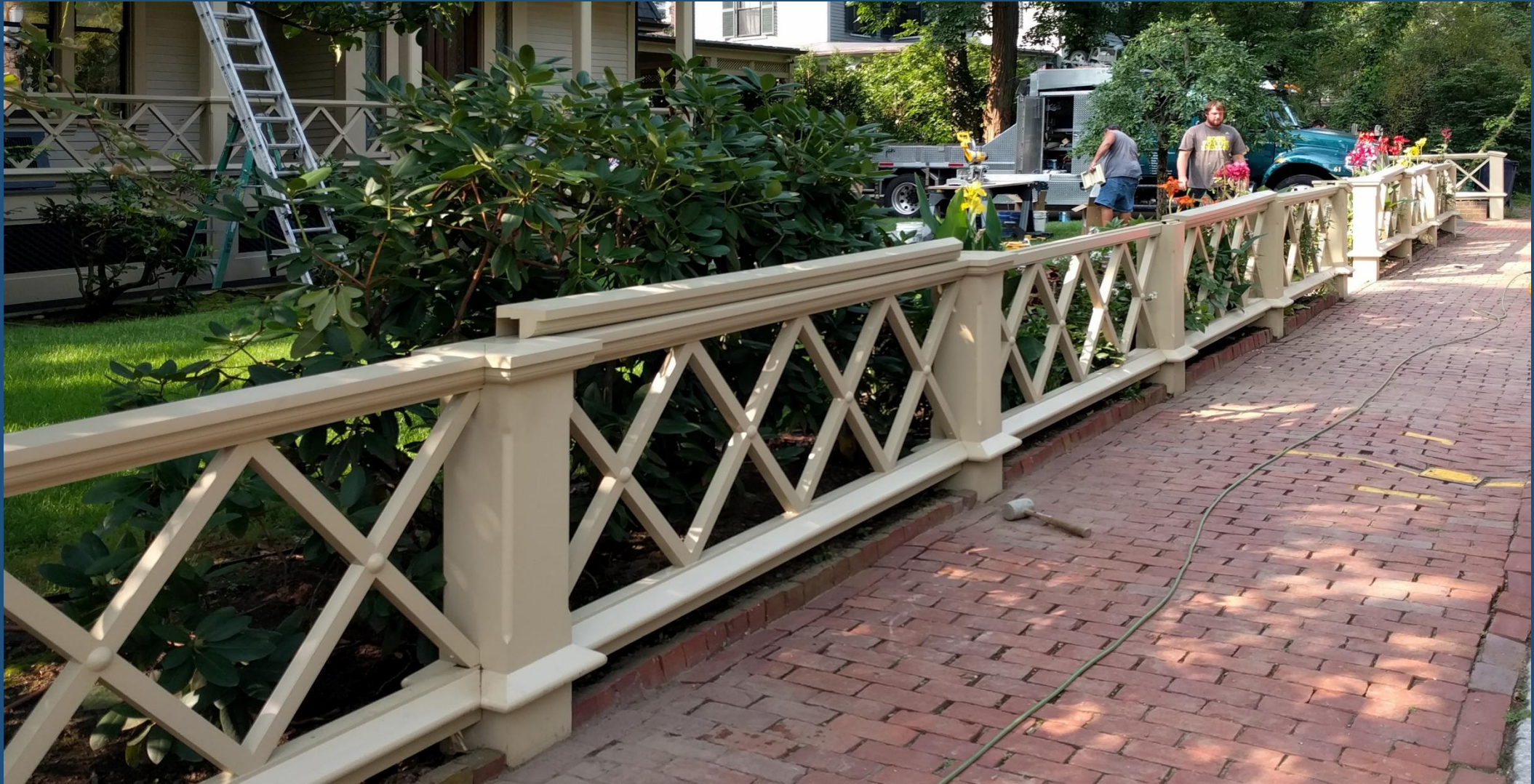
8 Follen Street, Old Cambridge Historic District Replica PVC fence under construction, August 2018