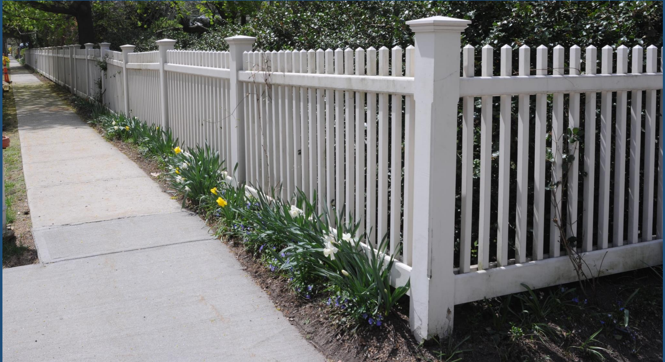
174 Brattle Street. Photo 2015.