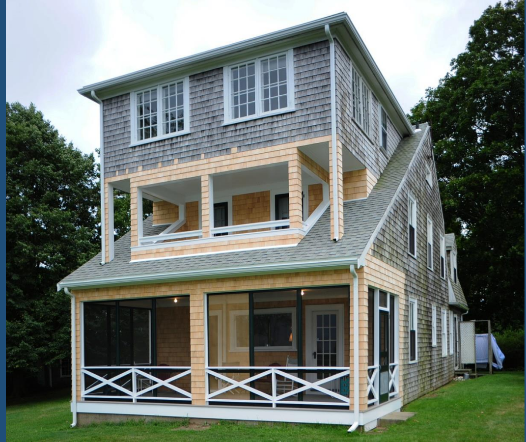
Duxbury, Mass. Porch reconstruction with PVC railings and trim, 2012.