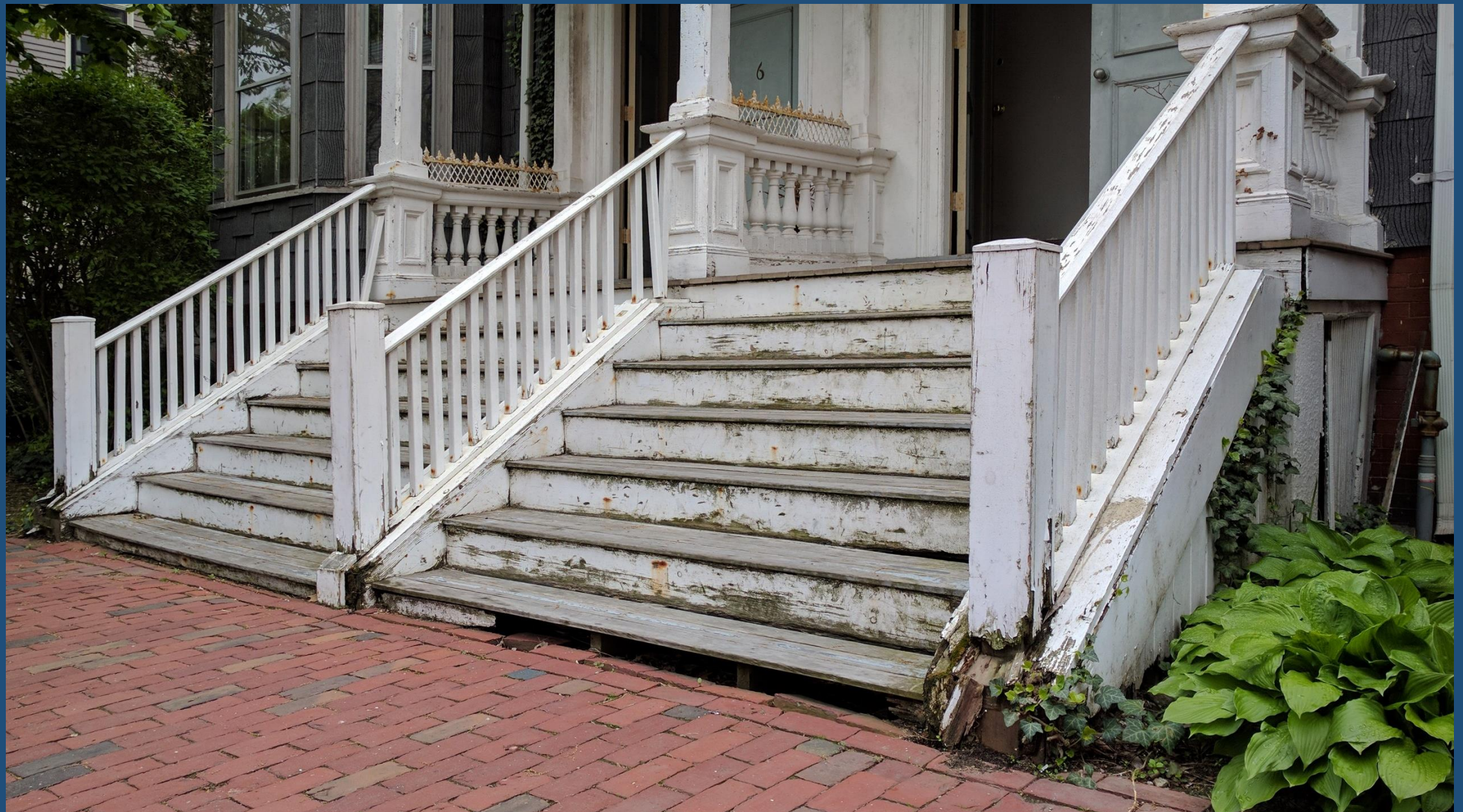
5-7 Clinton Street. Photo 2017.