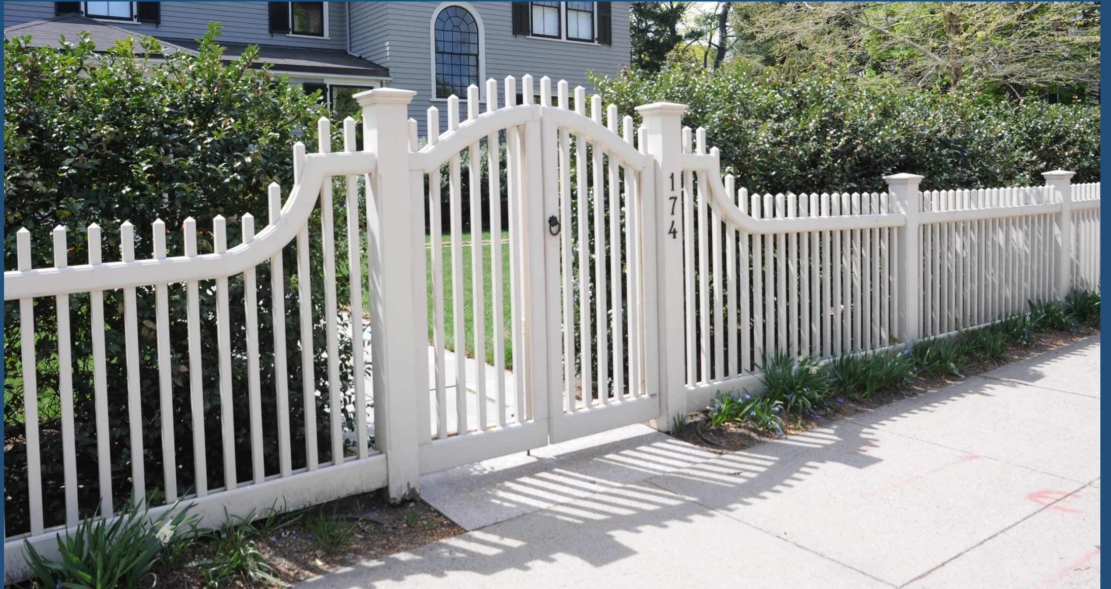
174 Brattle Street. Wood fence and gate installed 2003. Photo 2015.