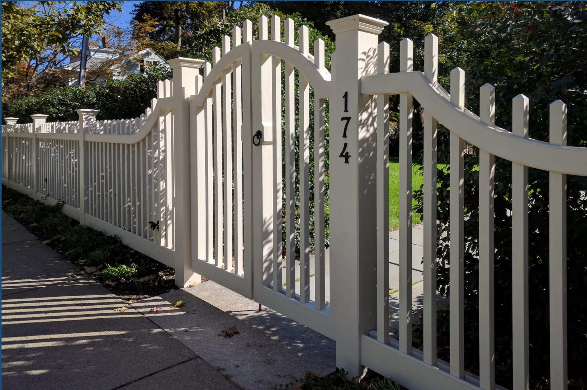
174 Brattle Street. PVC fence and gate installed 2015. Photo 2017.