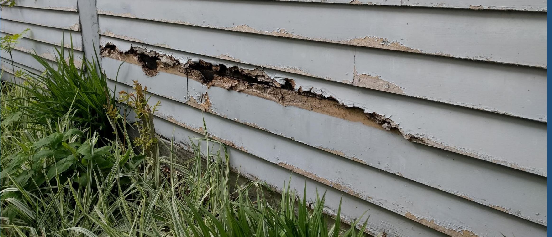
Masonite clapboards, 10 Salem Street (ca. 1971)