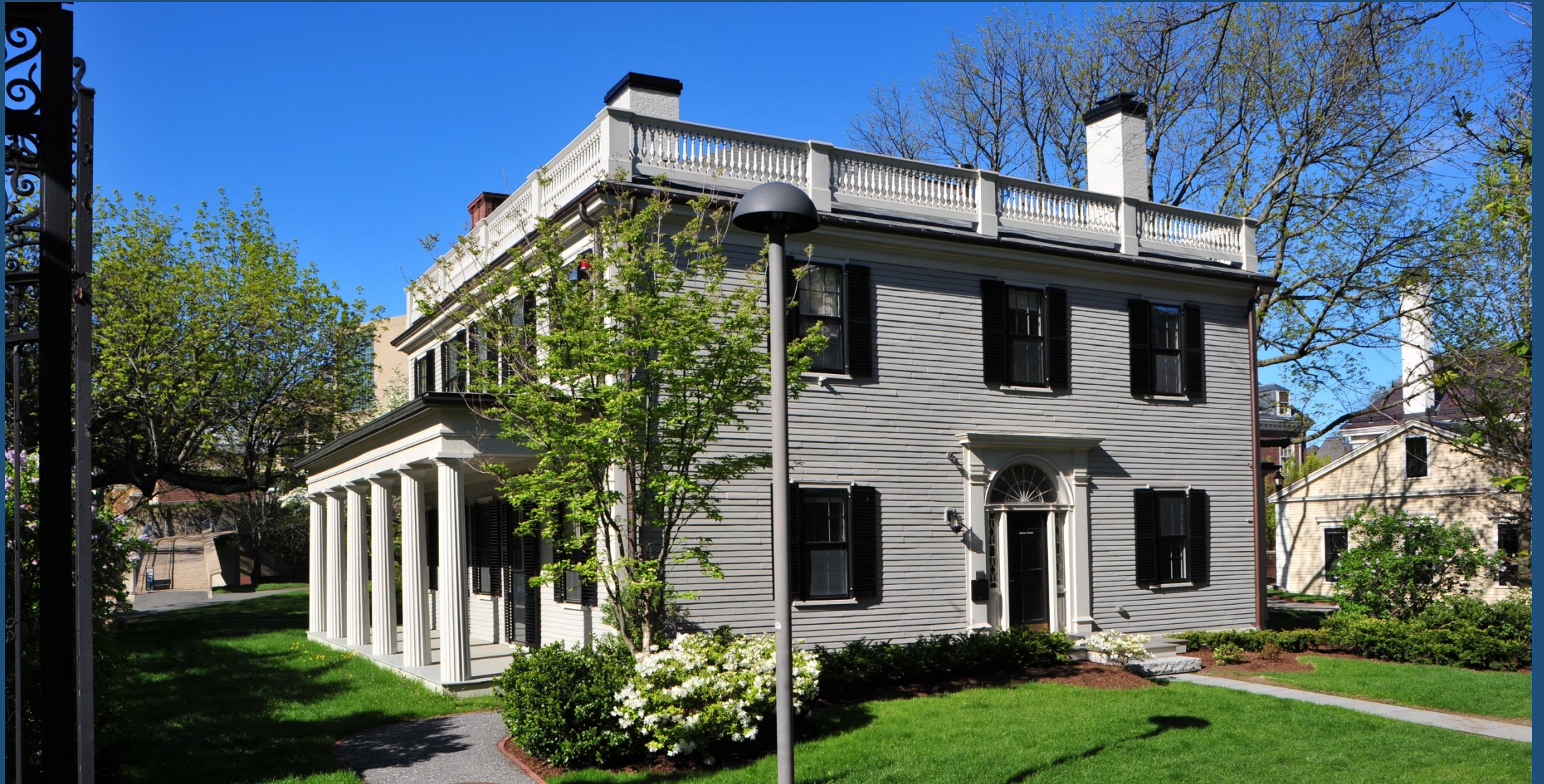
Dana Palmer House, Harvard University (1823; moved 1947). Photo 2017. National Register of Historic Places, CHC-HU protocol