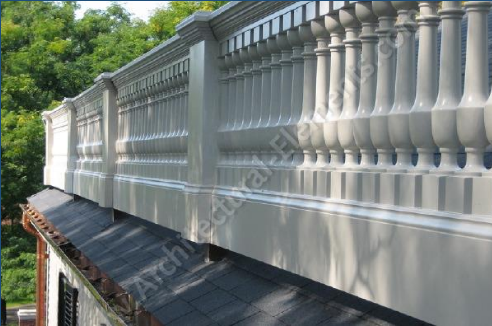
Reproduction high-density polyurethane balustrade, 2006 http://www.architectural-elements.com/reproduction-balustrade.html