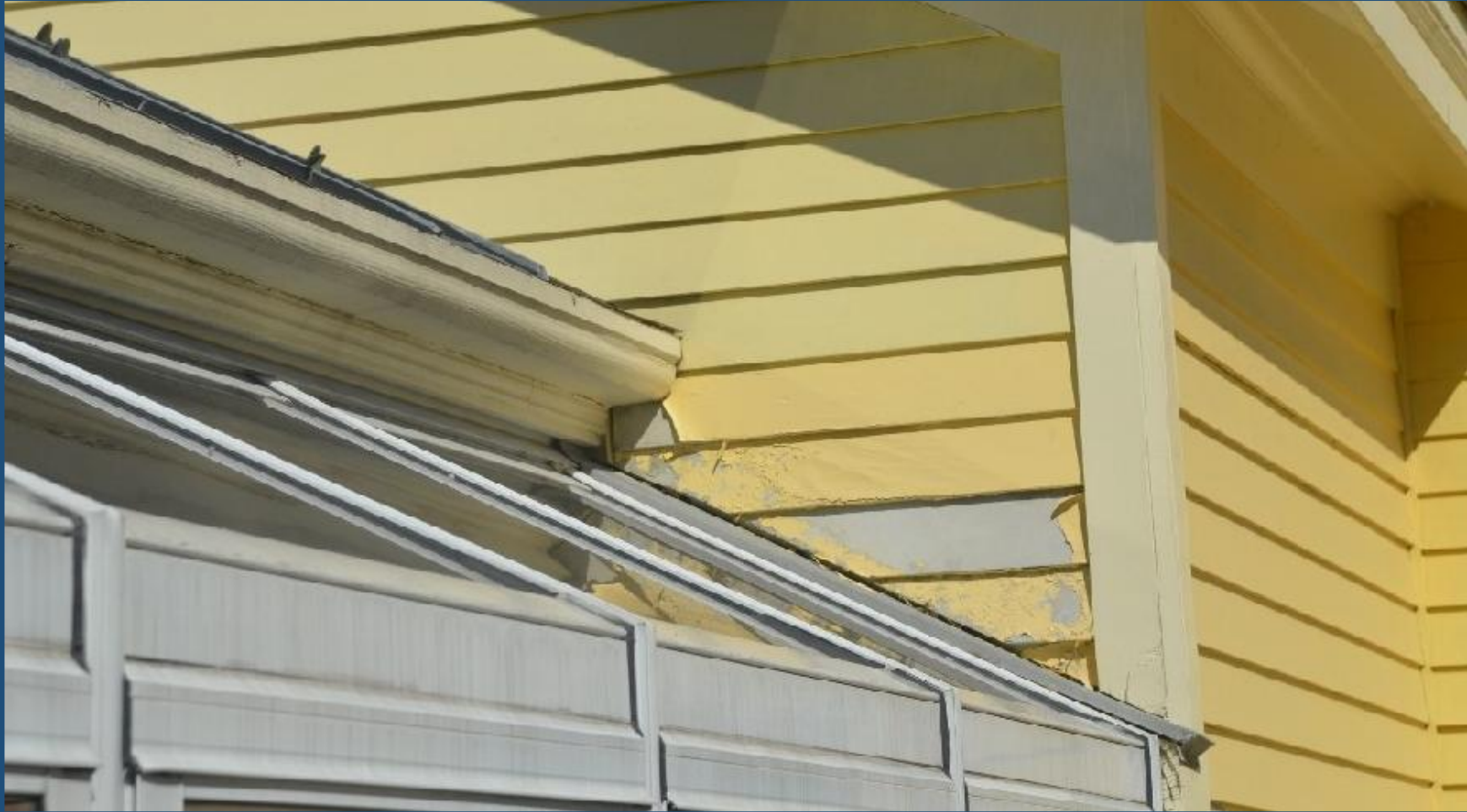
Old Cambridge Historic District New construction 2005: Hardiplank clapboards with wood trim and gutters. Photo 2016.