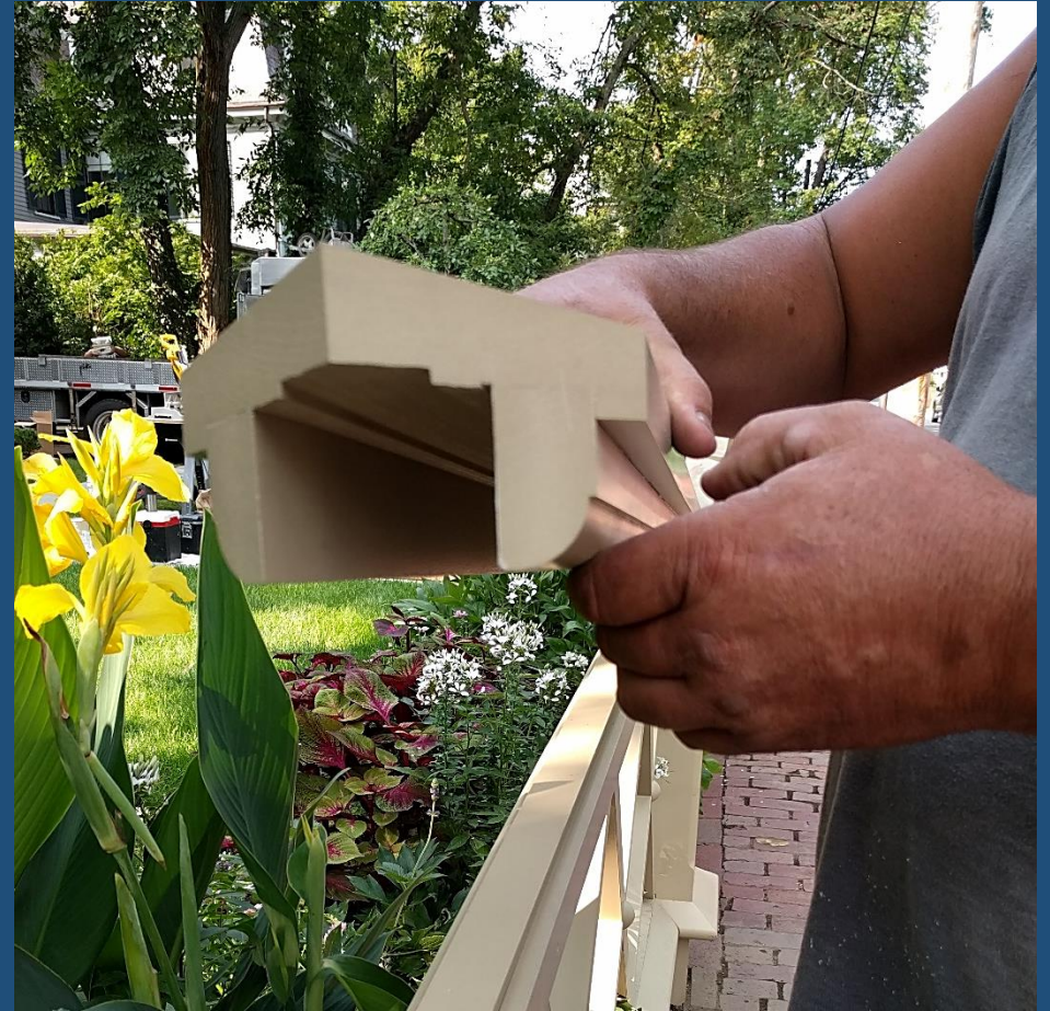
8 Follen Street, details of post and top rail PVC construction Contractor: Perfection Fence, Marshfield, Mass.