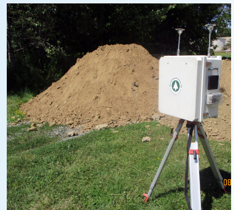
Typical Air Monitoring Station