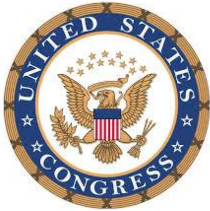
Congressional Budget Authority