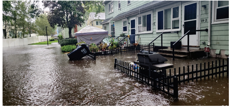
Corcoran Park has issues with flooding and sinkholes.