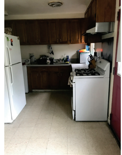
Existing units are undersized and inaccessible.