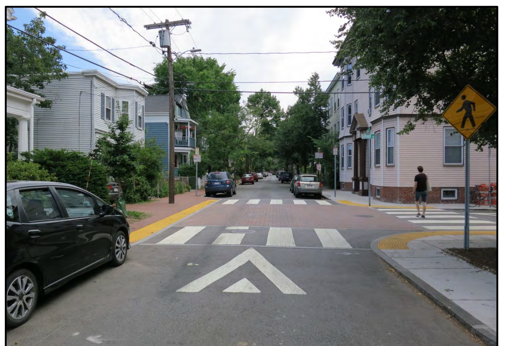
Raised Intersections (Tremont Street)