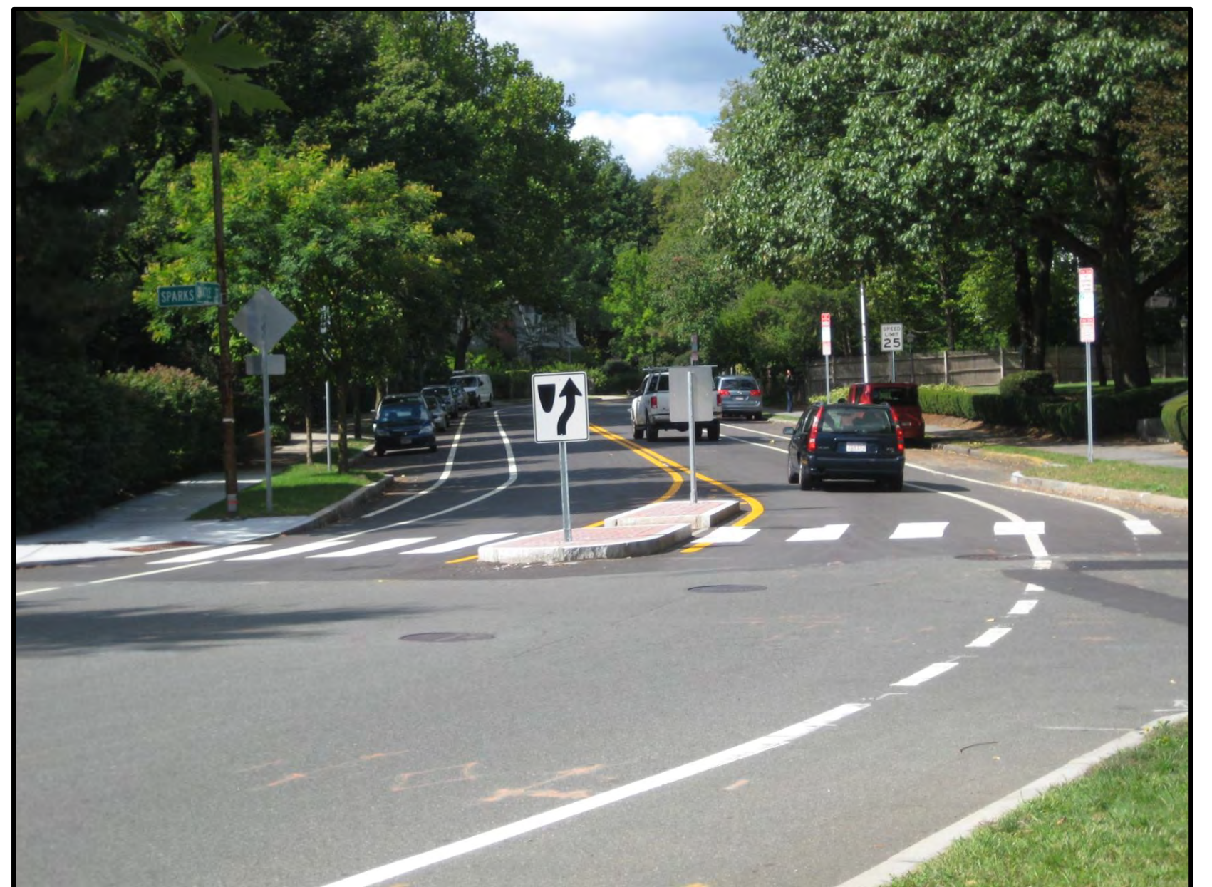
Crossing Islands (Brattle Street)