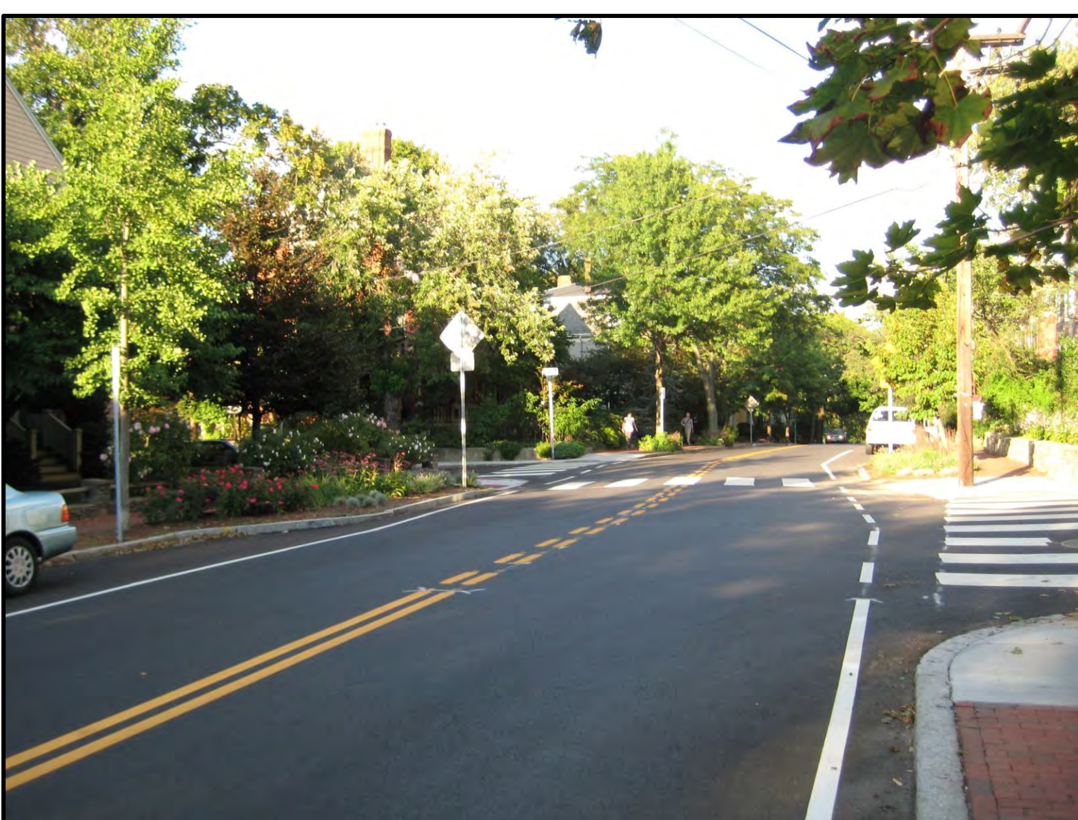
Chicanes (Upland Road)