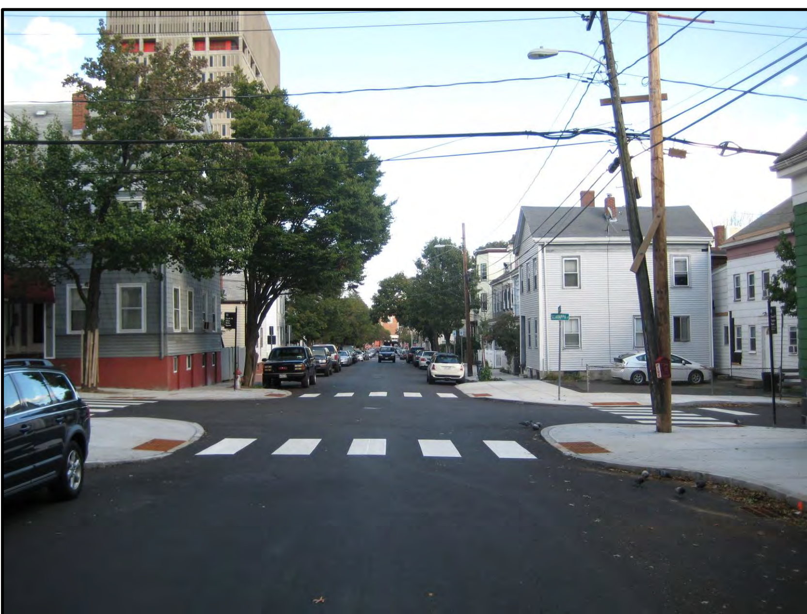
Curb Extensions (Sixth Street)