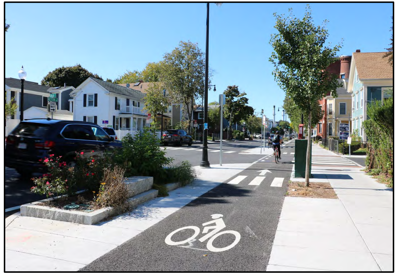
Modified Raised Crosswalk (Western Avenue)