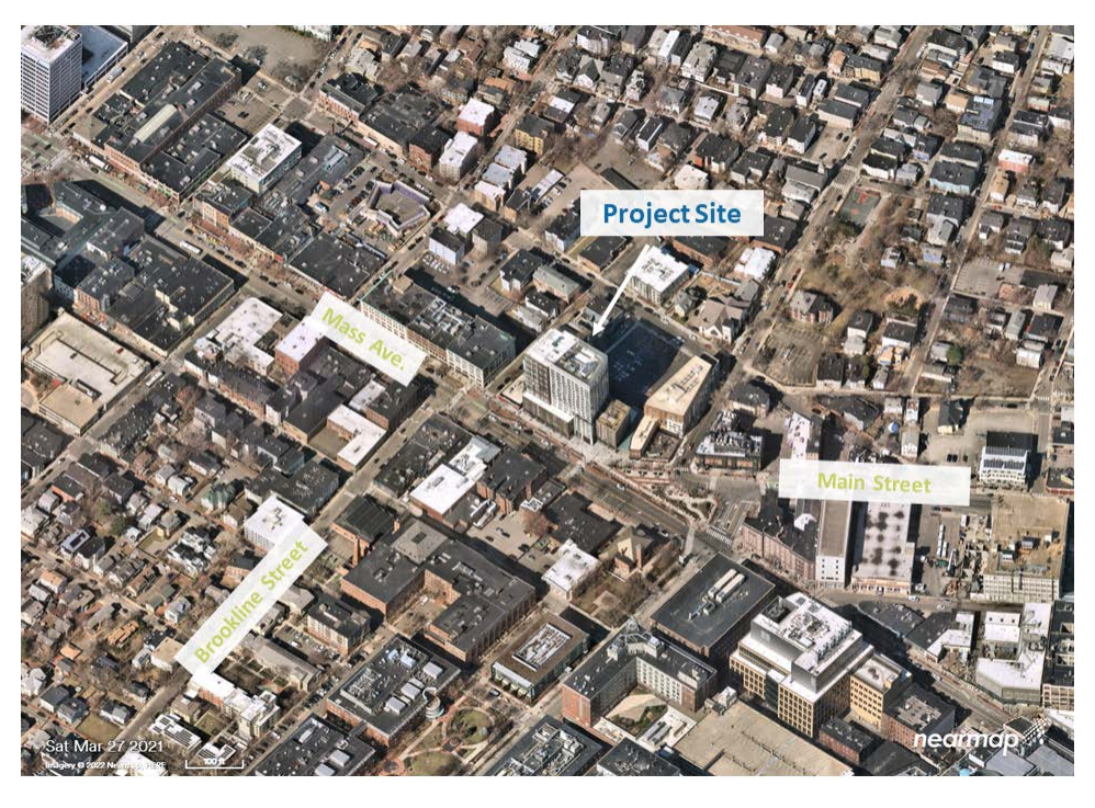
Site context for 425 Massachusetts Avenue.

is a Bluebikes station and a stop for the Route 1 MBTA bus in front of the building. Jill Brown-Rhone Park and Lafayette Square create a triangular plaza at the corner where Main Street and Massachusetts Avenue meet.