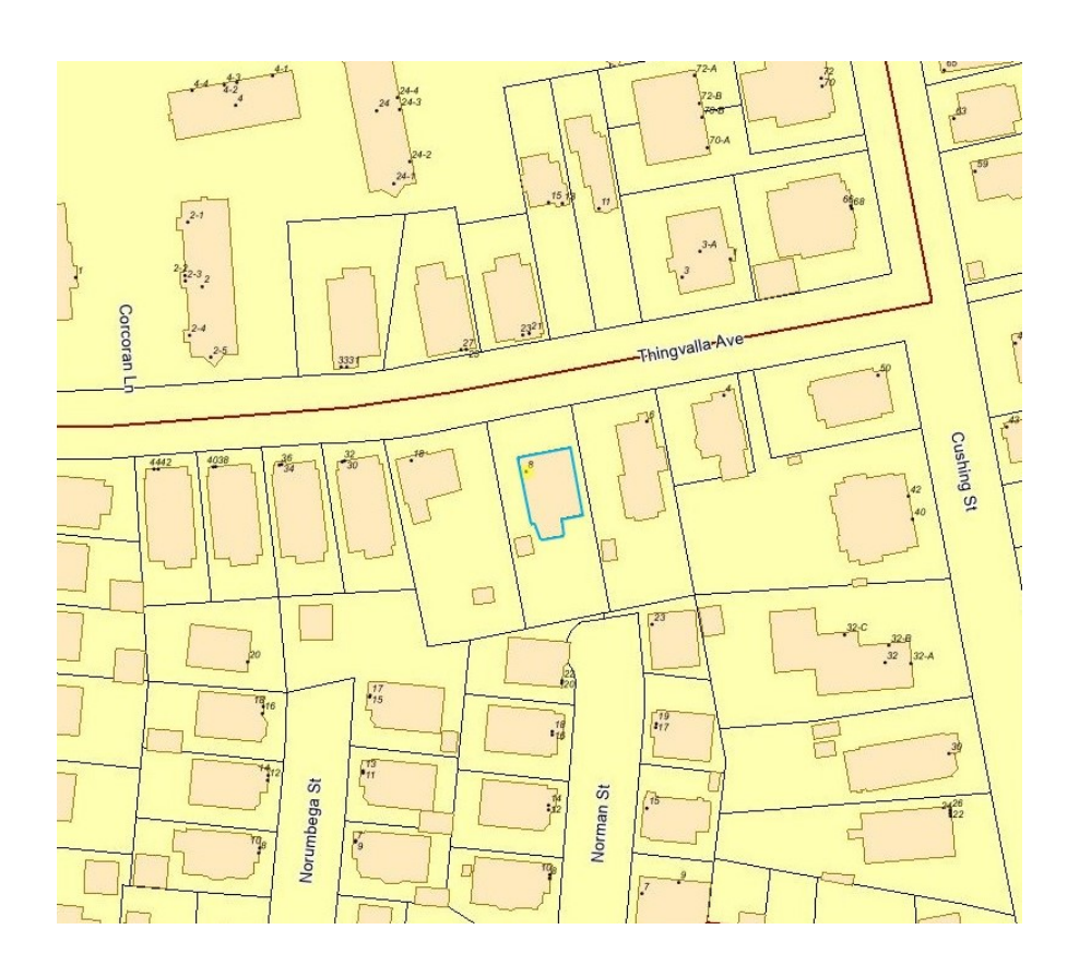
Zoning Map of Thingvalla Avenue section.