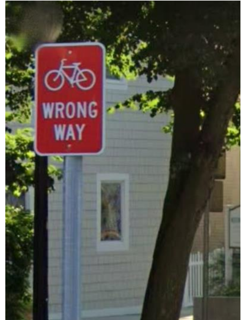
Wrong way sign on Western Avenue