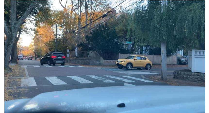
Clip recorded by a TP+T staff member - Thursday, November 3 approx. 8:30 a.m.