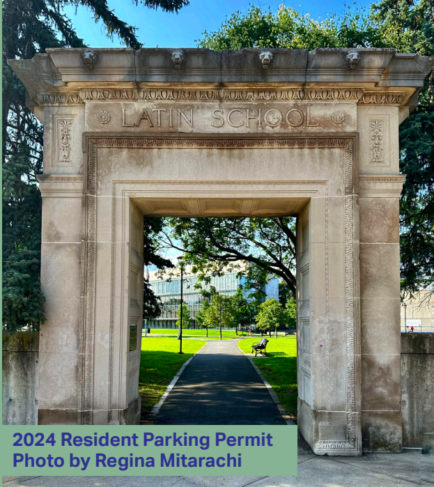
2024 Resident Parking Permit

City of Cambridge Traffic, Parking, + Transportation