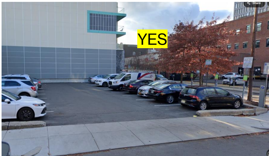
City Lot #4 in Central Square