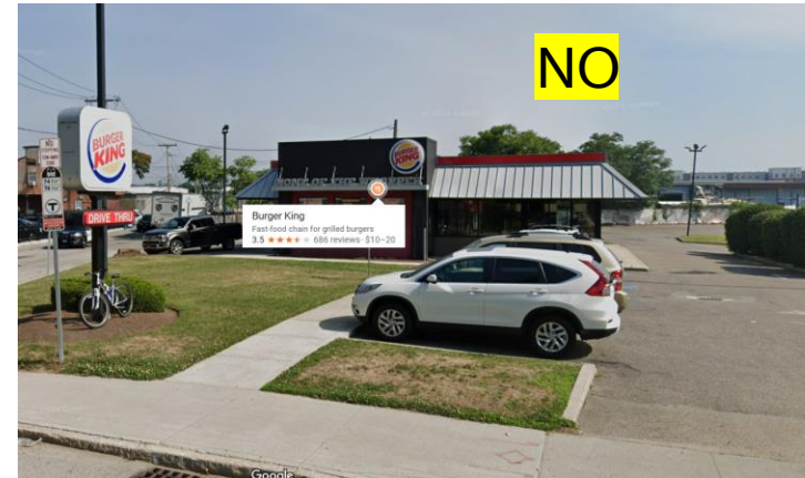
Porter Square shopping Center