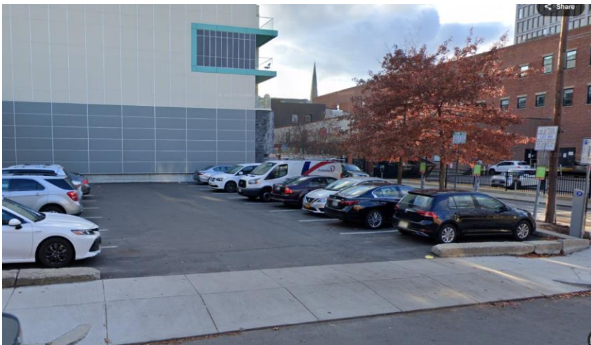
City Lot #4 in Central Square