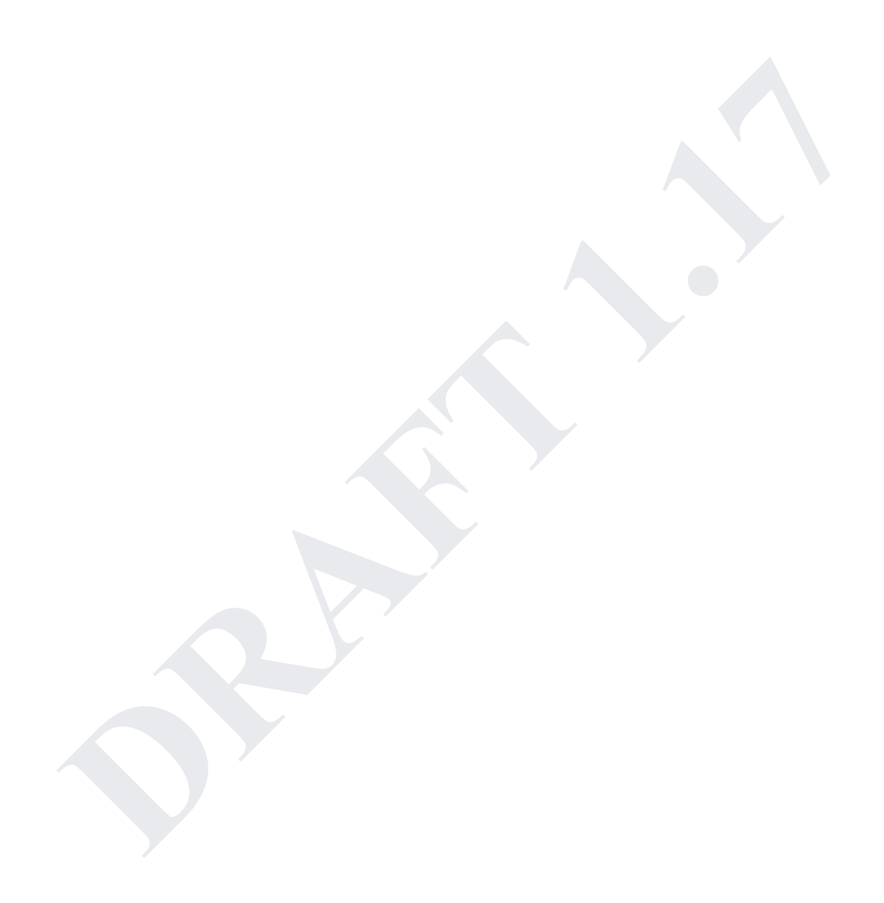
Appendix E: Public Comments