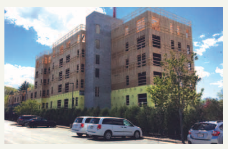
Concord Avenue housing.

The City's Winter Warming Center, operated by BayCove in partnership with Windsor House, expanded in its second year to be open the entire winter season. The Warming Center was designed to be a welcoming and accessible temporary night shelter for those who are homeless and may not be welcome at or wish to utilize other available services. This winter, the Center provided shelter to 589 different individuals. The majority of guests were males, ages of 45-54.