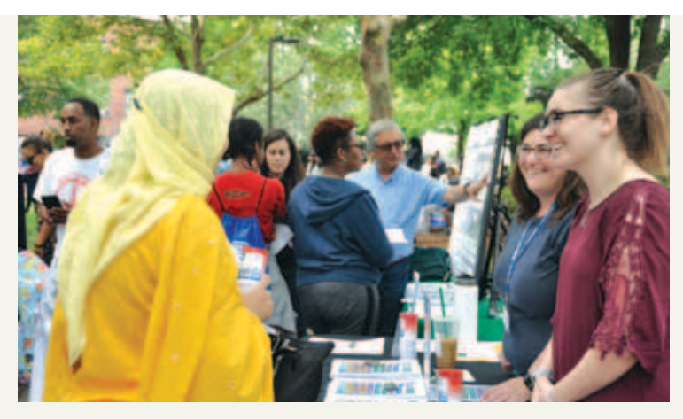
Residents learned about emergency preparedness and climate change at Port Pride Day.

partnered with youth centers to host five community conversations for families on talking with teens about substance use; and with CPS, individually interviewed 742 students to assess their risk for substance abuse.