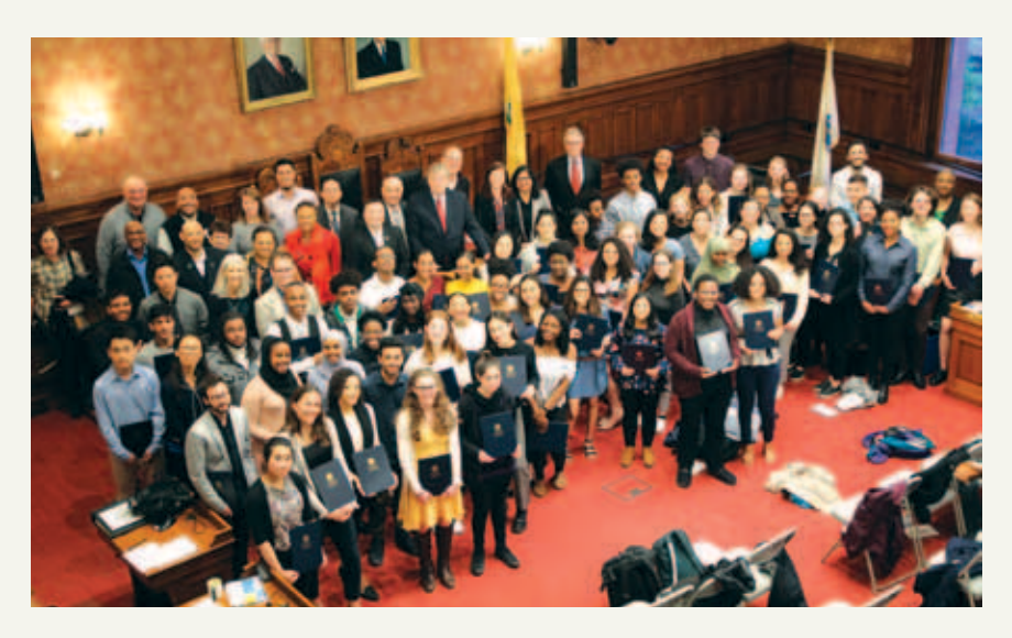
2019 City Scholarship Recipients. In May 2019, the City awarded 77 scholarships of $3,000 each. Since 1993, 1,029 scholarships totaling $2.4 million have been awarded.

As someone who spent the last 37 years working on maintaining the City's financial stability, I am proud that for the past 19 years, we have been awarded a AAA bond rating from the three major rating agencies. This achievement – which is a team effort between the City Council and the administration – allows the City to invest more money in capital projects, like new schools and