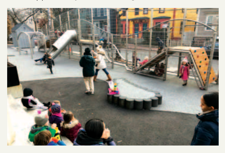
Play Area Renovations at Amigos and Morse Schools were completed. The renovations incorporated an innovative linear play structure to capitalize on limited space.

Preservation Awards. In May, outstanding local historic preservation projects were honored at the Cambridge Preservation Awards, held at Pentecostal Tabernacle, 56 Magazine Street. This building was celebrated for the restoration of its shingled façade and for its collection of handsome stained-glass windows, both of which were supported by Preservation grants.