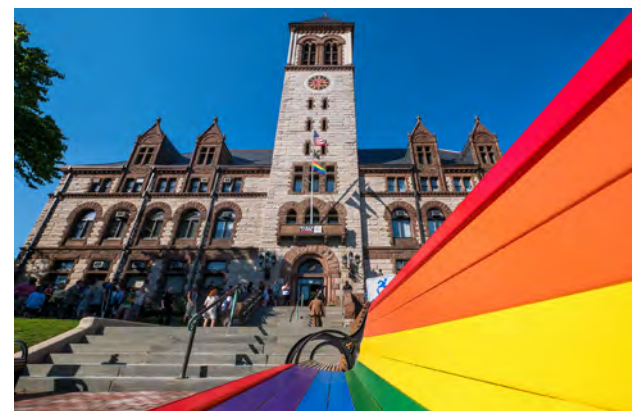
Cambridge City Hall

Since 2018, over 80 City leaders have been learning together in four Cohorts which are guided by a set of Leadership Expectations grounded in four Core Beliefs.