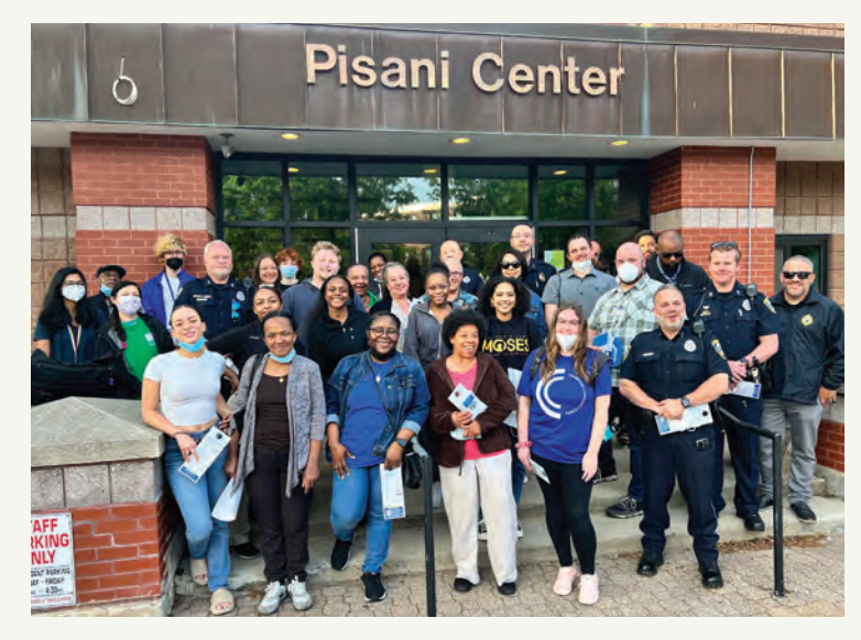
The CET and Cambridge Police collaborated on door-to-door neighborhood outreach.

The Community Engagement Team's (CET) efforts shifted from pandemic crisis work to more sustainable family support, including sharing educational resources and career opportunities with Cambridge families. CET hosted 4 virtual networking events on best community