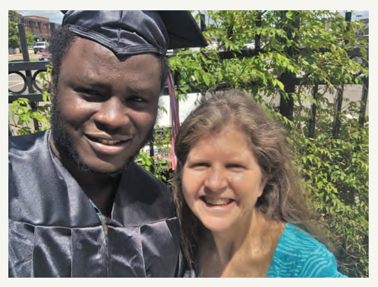
A College Success coach celebrates with a college graduate who participated in the College Success Initiative.

Just A Start Youth Build , working in collaboration with City Housing staff, provided building rehab training opportunities to 38 at-risk youth.