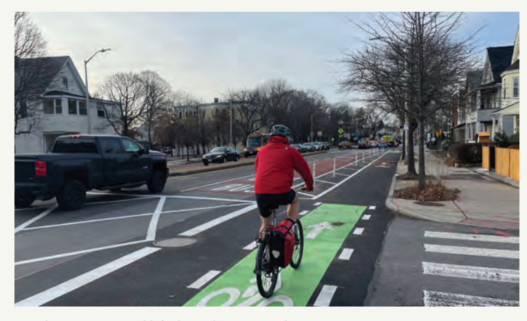
A cyclist in a separated bike lane along Massachusetts Avenue.

Linear Path Reconstruction & Danehy/New Street Connector Path. Design work began in FY22 on two path projects. Redesign and reconstruction of Linear Park path (from Somerville line to Russell Field) will include new landscaping/trees, lighting, seating, and playful elements to engage users of all ages. The second project