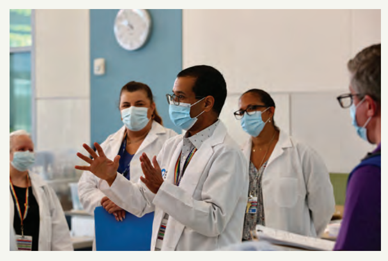
Nurses from Cambridge Public Health Department prepare for a vaccine clinic.

Equity Specialist whose work will focus on health promotion for all Cambridge students, with a particular focus on barriers and inequities related to race/ethnicity, culture, language, and socioeconomic and LGBTQ+ status.