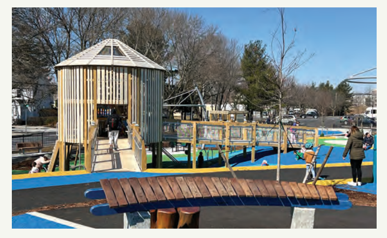
Louis A. DePasquale Universal Design Playground at Danehy Park.

Our Cambridge Street (Inman Square/Cambridge Street Corridor Planning). The Envision Cambridge plan articulated a shared vision for sensitive growth by identifying the type, scale, and location of development needed to meet community goals. Inman Square and Cambridge Street were identified as areas with potential to advance the City's priorities. In FY22, the City started a community planning process to develop place-specific recommendations to realize shared community goals for this area.