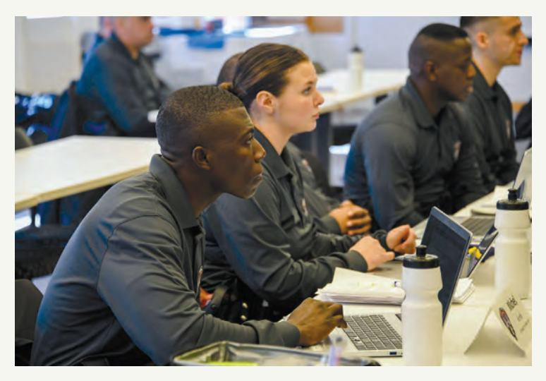
CPD is pursuing a gold standard in accreditation.

Accreditation from Commission on Accreditation for Law Enforcement Agencies (CALEA). In FY22, CPD began a complete review and re-write of its policies, procedures, rules, and regulations through the lens of procedural justice. A multi-year process, obtaining CALEA accreditation is considered the gold standard in law enforcement and mirrors the department's mission of procedurally just policing. As the result of the work