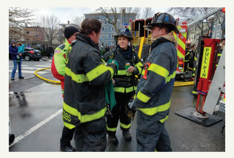
Cambridge firefighters rest after responding to an incident.

COVID-19 Testing & Vaccination Efforts. In FY21 and FY22, Cambridge Fire Department, in collaboration with Cambridge Public Health and Cambridge Police departments conducted citywide COVID-19 testing, and in January 2021 began providing COVID-19 vaccinations, following state and federal guidance. (See COVID-19 section)