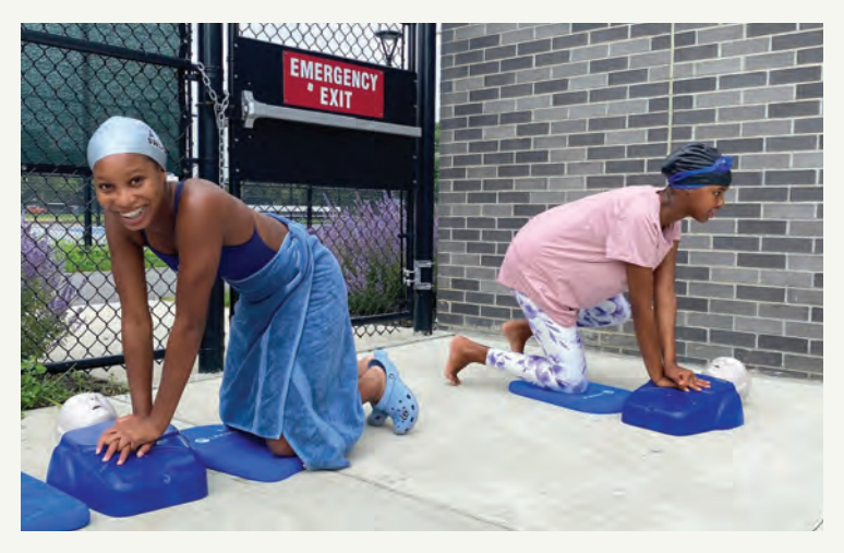
Mayor's Summer Youth Employment Program participants learn lifeguarding skills at Gold Star Pool.

The Cambridge Program and Camp Rainbow returned to in-person programming, providing connection, care, and recreation to over 100 children and adults with disabilities. In December 2021, the Cambridge Program holiday play featured 42 talented actors from the program. In April 2022, the Cambridge Program's two basketball teams became Massachusetts Special Olympics State Champions after winning division tournaments.