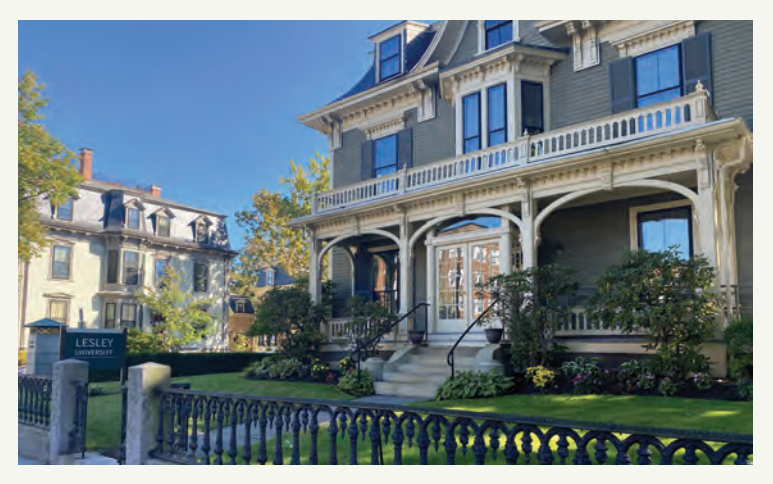
Planning will soon begin for the creation of new affordable housing at 1627 Massachusetts Avenue near Harvard Square.