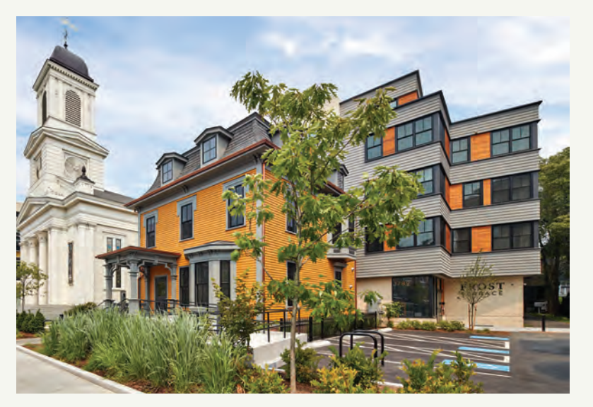
The completion of Frost Terrace in FY22 brought 40 new affordable housing units to Porter Square.

• Frost Terrace. 40 new units of affordable rental housing in Porter Square were completed in FY22.