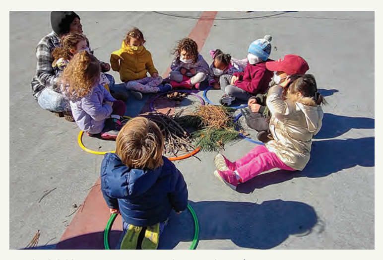
Preschool children enjoy stories around a pretend campfire.

The Office of Workforce Development (OWD), based out of the Department of Human Service Programs, partnered with Innovators for Purpose to pay students to work in a social justice-oriented design and innovation studio. OWD also collaborated with Cambridge STEAM Initiative to support high school students in a Science Research Mentoring Program at the Harvard and Smithsonian Center for Astrophysics and MIT. OWD continued to operate the Youth Employment Center at