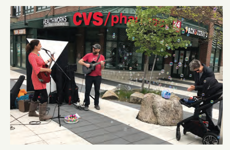
A Cambridge Plays event in Porter Square.

Tourism, Economic Development and Arts Committee. City departments continue to partner with Cambridge Office for Tourism and Cambridge Arts Council to support arts, tourism, and economic opportunity. In FY22, the group collaborated on online and social media promotions for small businesses; Open Studios Creative Marketplace; and Cambridge Plays, a series of outdoor music, arts, and play events in commercial districts and parks.