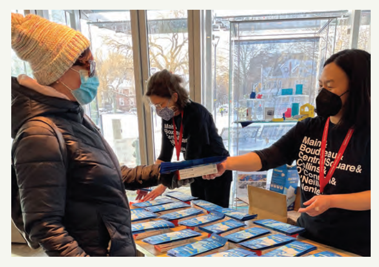
City staff hand out free at-home COVID-19 test kits.

During the 2022 State of the City Address in April, it was announced that the City of Cambridge will be allocating close to $22 million in ARPA funding to build on the work of the Cambridge RISE pilot and combat the adverse effects of the pandemic faced by low-income families in Cambridge. This allocation will provide direct cash