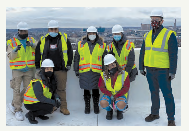
Participants of the Next Up program visit a work site.

The Cambridge STEAM Initiative collaborated with the Birth to Third Grade Partnership to organize a workshop series for Preschool/JK/K Out-of-School Time staff focused on environments and activities that foster curiosity. Staff have engaged local STEAMers to deliver workshops, promoting shared learning and connection. The STEAM Initiative is partnering with Science Club for Girls, Broad Institute, Cambridge School Volunteers, Lemelson MIT, MIT Museum to develop a Spaces of Belonging training system for industry and community volunteers to ensure that all adults who mentor Cambridge's diverse young people engage through an anti-racist lens to create spaces of belonging. Teen focus groups were organized to assess the impact and efficacy of the training and its resonance. The STEAM Initiative also ran a successful outdoor STEAM It Up! event in North Cambridge in Fall 2021, attracting hundreds of Cambridge families.