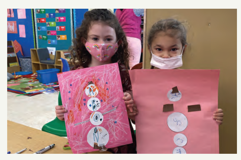
Two DHSP Preschool students display art projects they created in class.

Cambridge Youth Programs (CYP) offered year-round, high-quality programming to pre-teens, middle schoolers, and teens at five Youth Centers. CYP prioritized lowincome applicants and enrolled pre-teens and middle schoolers through a lottery system.