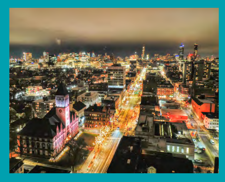
Photo: Nighttime view of Cambridge with City Hall in the foreground by Kyle Klein.