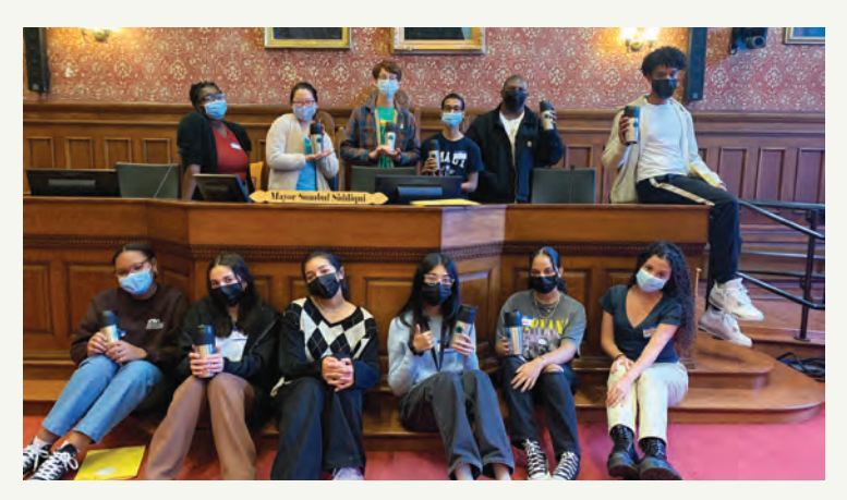
Cambridge Youth Council.

Library Branch Hours were Expanded to at least five days of library service, including three nights, at all branch locations for an increase of over 50 hours of service per week across the library system. This also includes expanded Saturday hours and a pilot of Sunday summer hours at the Valente Branch.