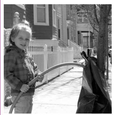
A Junior Forester

Public Works recently launched a new feature to report potholes on our website: www.cambridgema.gov/theworks. You may also now report potholes via e-mail to: potholes@cambridgema.gov.