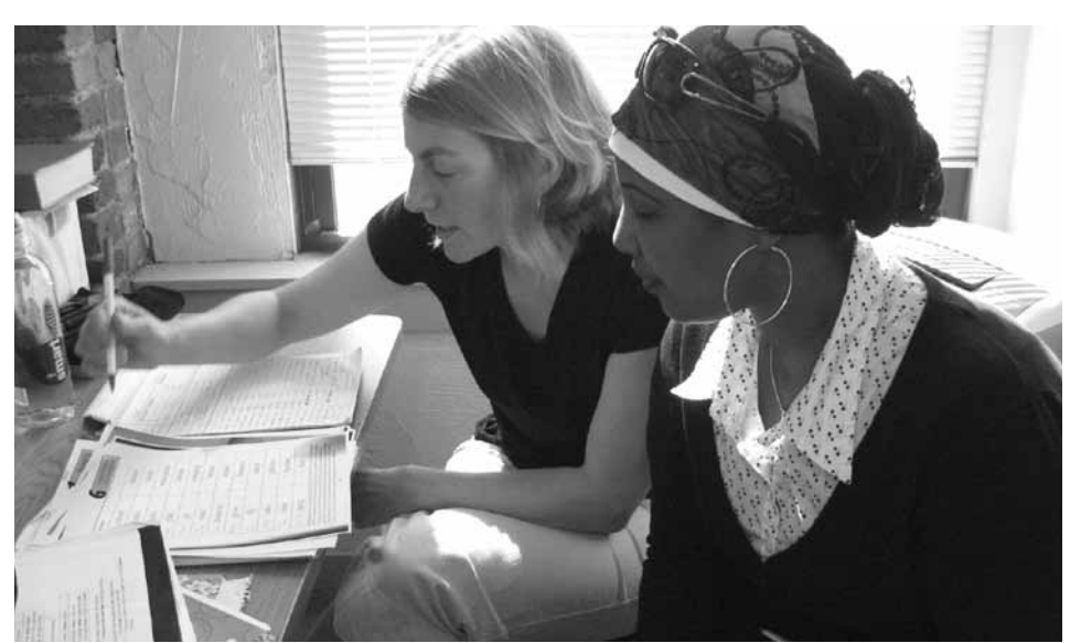
Learning English, civics, and computer skills at the Community Learning Center.