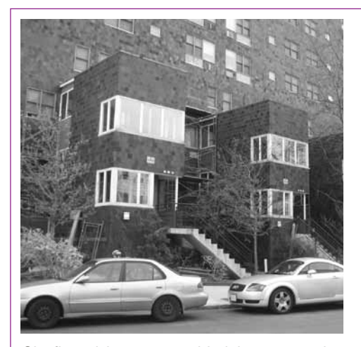
City financial support enabled the preservation of affordable housing in the heart of Inman Square.