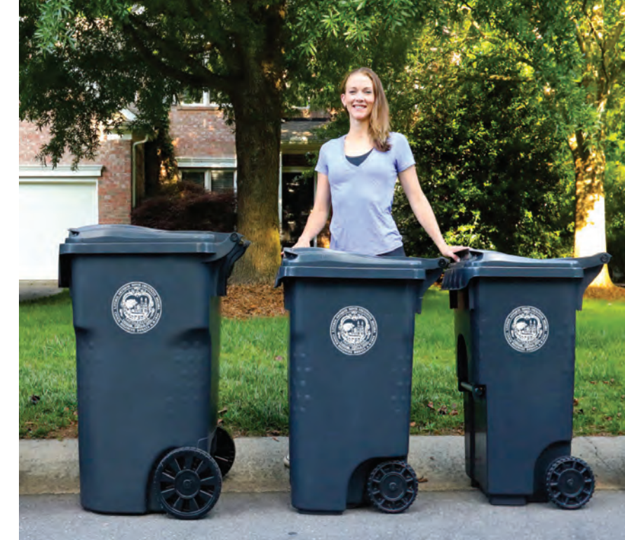
An example of three different trash carts the City may select for the new program.

In early 2022, the City will host a community meeting about the new program. The City will also send a postcard with information on when to expect the new trash cart and how to dispose of old trash barrel(s). The new trash carts will come in three different sizes to accommodate different building sizes. Sign up for the City's monthly Recycling, Composting, and Trash Newsletter to stay in the loop on this program and other waste programs in the City at Cambridgema.gov/Subscribe .