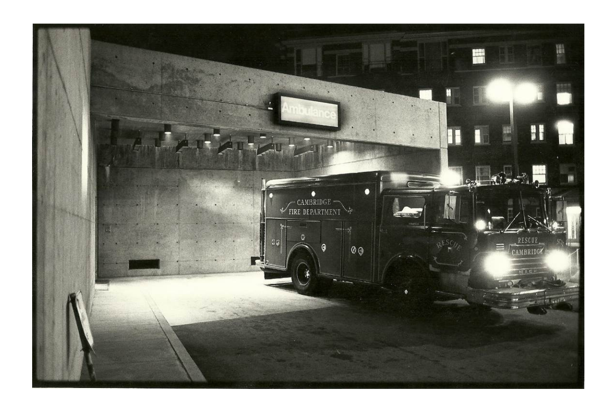
Through the Lantern Lens