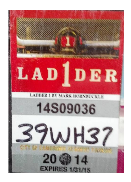
Actual Parking Sticker