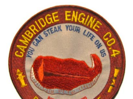
Engine Co. No. 4's old patch