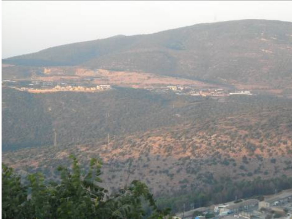
The Golan Heights. Note how dry and barren the ground is. This would be the site of a devastating wildfire two weeks later that claimed many lives.

While Israel has committed many resources to its defense against terrorism unfortunately they have not done so with their fire service which is also a national organization. That would be evident two weeks after we returned home when a devastating wildfire killed over 40 people. Many of those killed were corrections officers who were dispatched to assist in firefighting efforts.