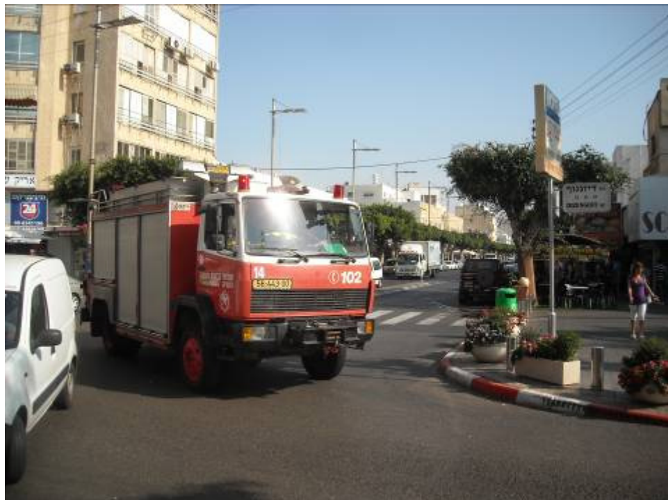
Fire Apparatus responding to a horse drawn carriage accident in Netanya.