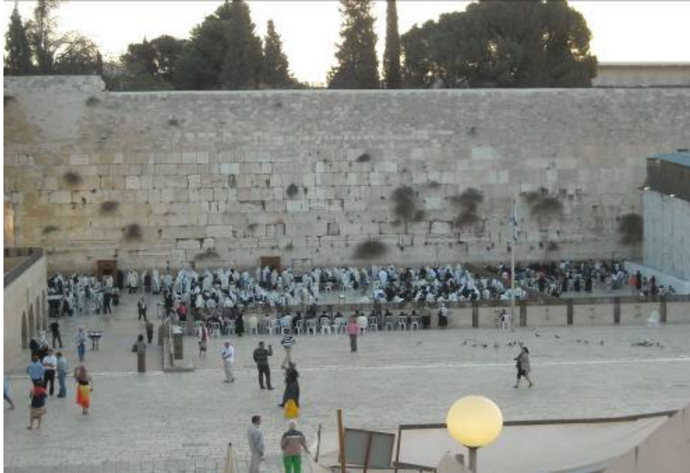
The Western Wall, considered one of the holiest sites in the Jewish faith.