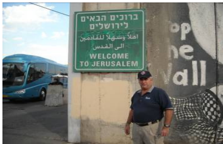
At the border crossing known as Area A; West Bank

The first of many lessons about Israeli resiliency was learned at Mike's Place. Within 48 hours of the suicide bomber attack which killed 3 people and wounded over 50, they were back open for business! The philosophy is pretty simple. If you cower or go away, the terrorists win.