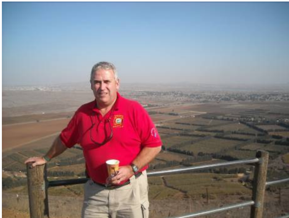
In the Golan Heights with Syria in the background.