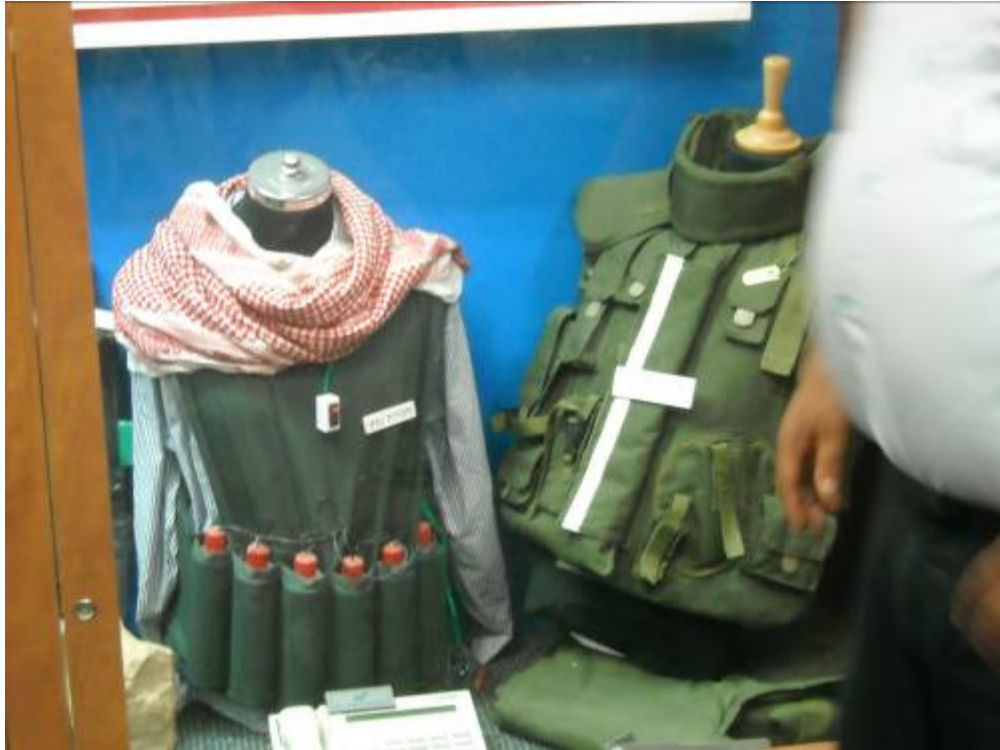
Suicide Bomber Vest at Police Academy Museum.

On the way to the Golan Region we stopped in the town of Netanya. This unfortunately was the site of one of the worst terrorist attacks, the Passover Seder attack in the Park Hotel when a suicide bomber killed 30 civilians and injured 140 in March 2002. We spoke with the hotel manager whose brother was killed in the attack.