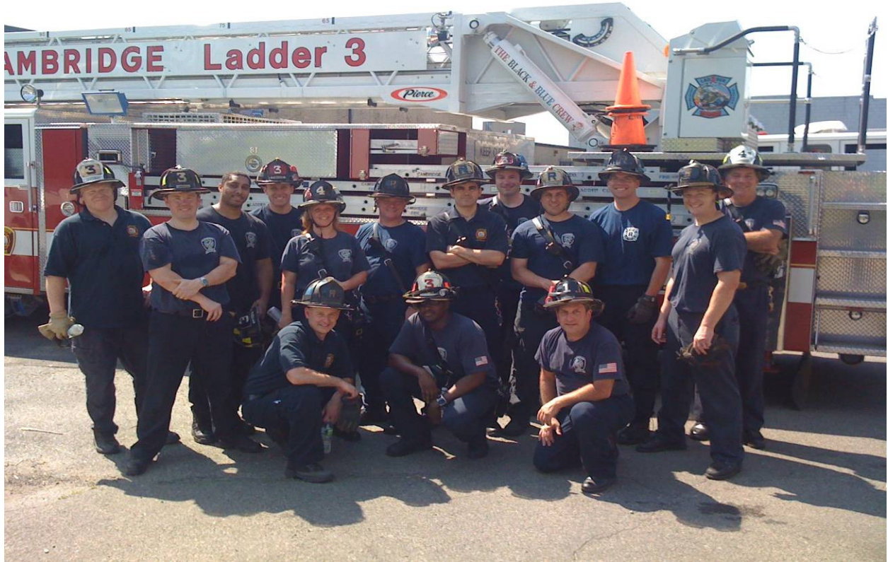
Members of Group 3 participated in the Basic Ladder Training this day.