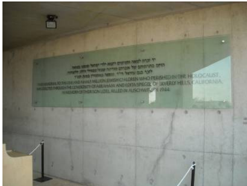
Entrance to The Children's Memorial at Yad Vashem

Yad Vashem is the National Holocaust Memorial and museum located on the Mount of Remembrance in Jerusalem. Words cannot adequately describe what I experienced as I walked through this magnificent series of buildings. Ironically the architect Moshe Safdie, has an office in Somerville and lives in Cambridge.