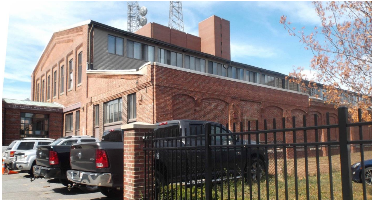
101 Rogers Street