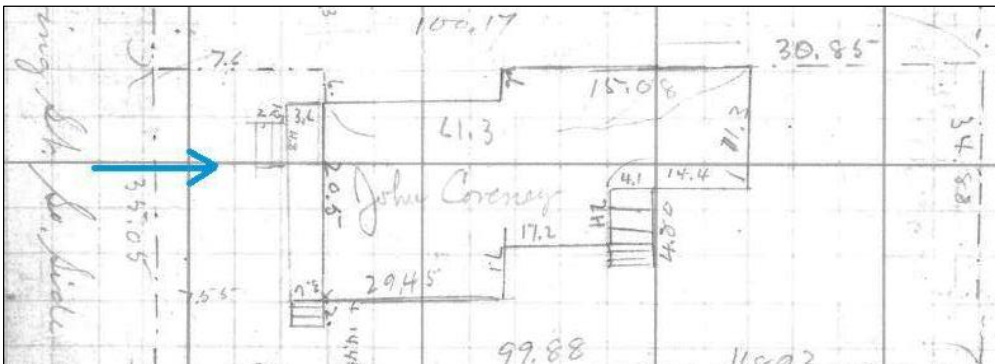
City Engineer's sketch of the exterior dimensions of 68 Spring Street in 1876; measurements are in tenths of a foot. House Book 14/page 58.