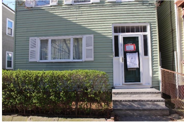
CHC staff photos, taken 04/29/19.

Examples of what 68 Spring Street may have originally looked like can be found at 69 and 102 Thorndike Street, both also constructed in 1844.