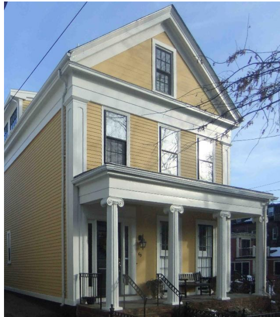
69 Thorndike Street and 102 Thorndike Street (both 1844) are variants of the side-hall Greek Revival house, built with and without a front portico.