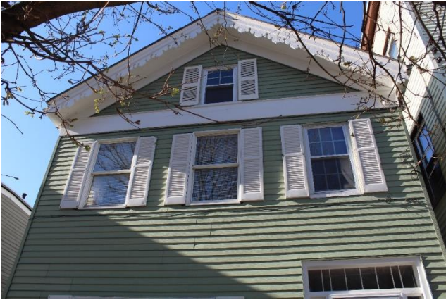
68 Spring Street