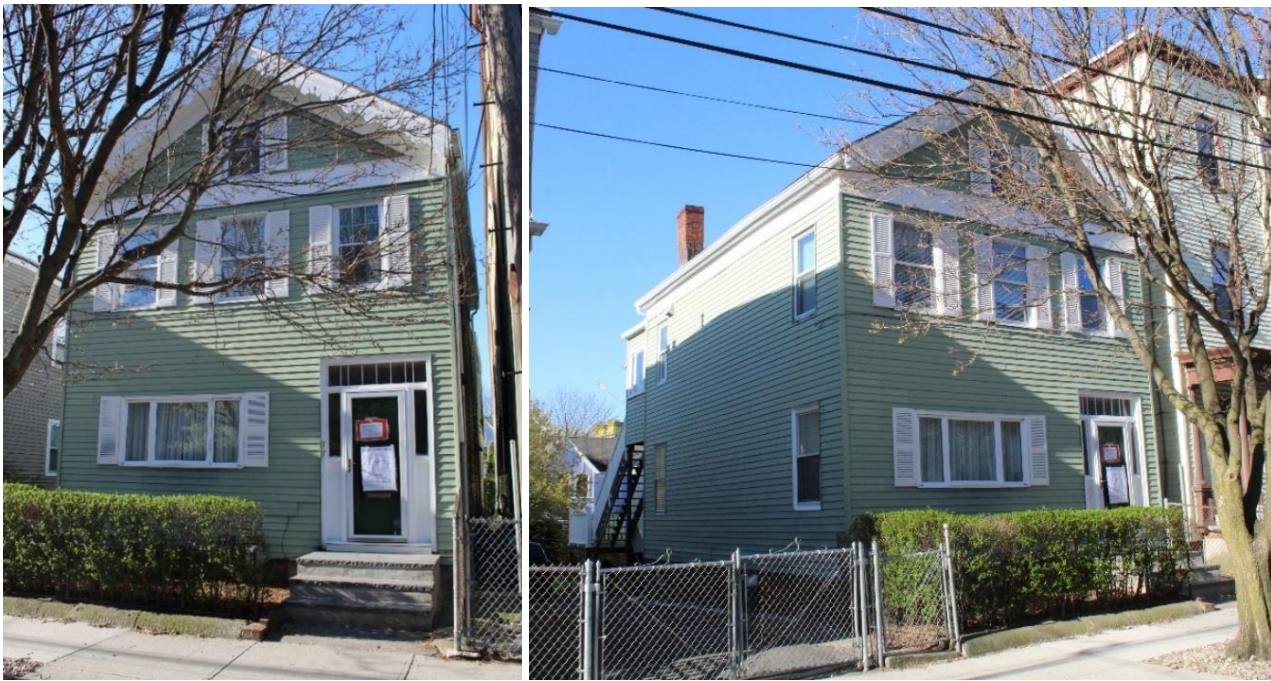
68 Spring Street.

The neighboring properties on Spring Street have a variety of roof forms and in overall scale with the two adjacent properties being a squat Mansard home to the left and a taller triple-decker to the right. Across Spring Street, five Greek Revival rowhomes showcase the side-gabled variation of the style.