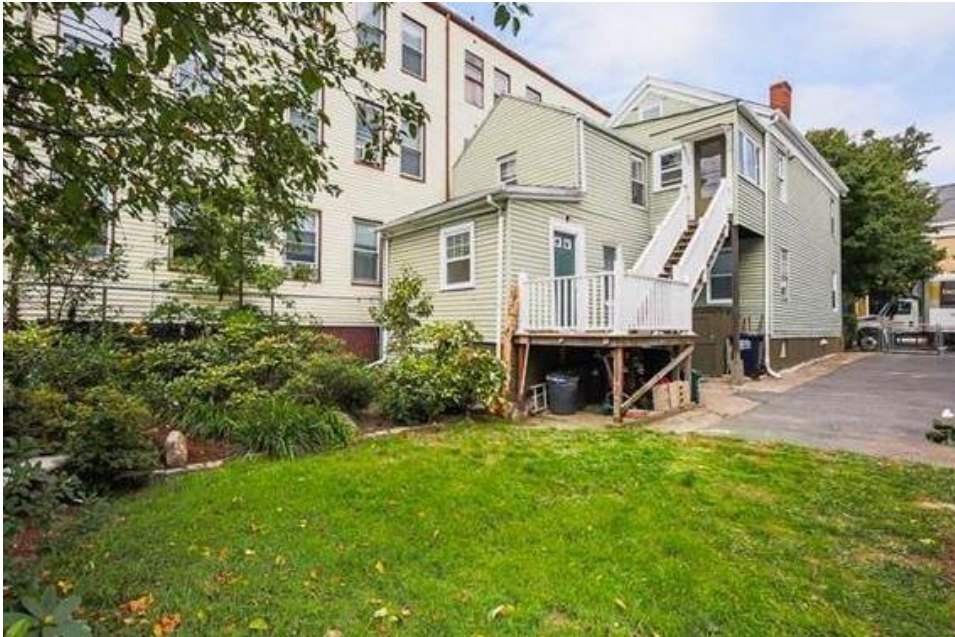
68 Spring Street, rear additions and deck.

The proposed project would remove the roof and increase the attic level clearance from 8'- 3 7/8" to 11'- 1 1/4". Plans also call for the demolition of the rear exterior stairs and entries with the replacement as usable enclosed space. The one-story addition at the rear is proposed to be replaced with a raised deck with steps to a rear door with the existing foundation to remain.