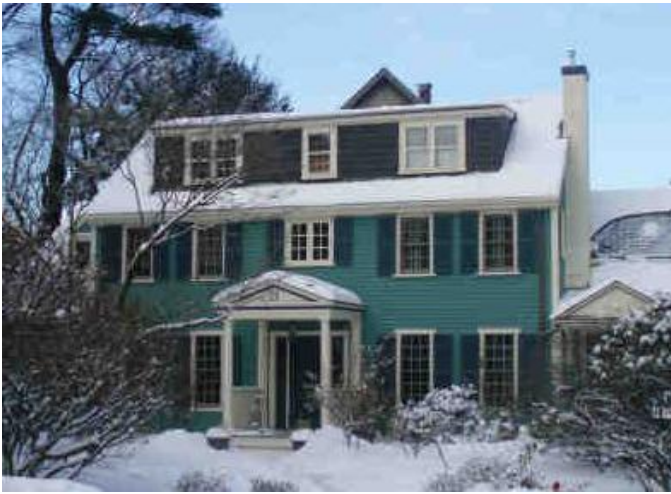
14 Wyman Road (1927, Duguid & Martin)