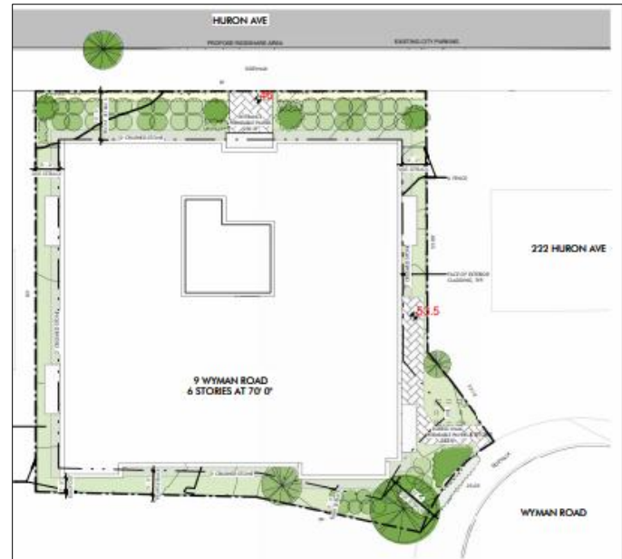
Anderson Porter Design