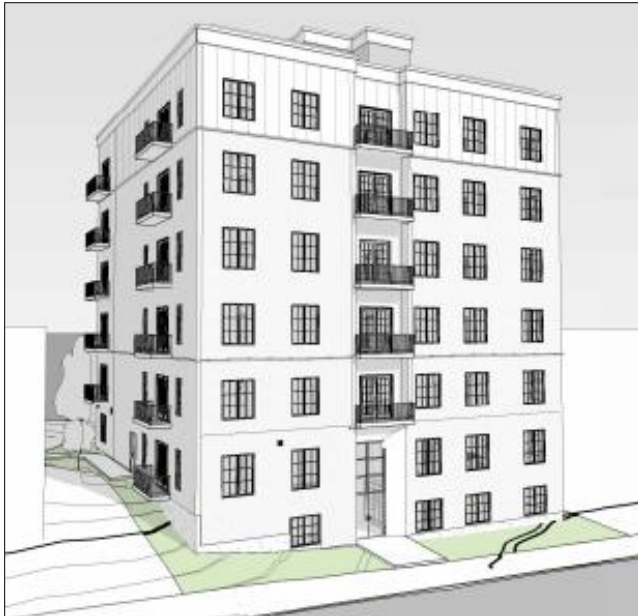
9 Wyman Road (January 30, 2026)

In December 2025 the Community Development Department received an application for a staff advisory consultation for a proposed six story residential apartment building consisting of 56 dwelling units at 9 Wyman Road. A staff review in February requested minor modifications, but found the building generally conforms to the legal requirements.