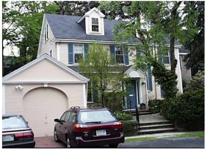
10 Dunstable Road (1927, Duguid & Martin)