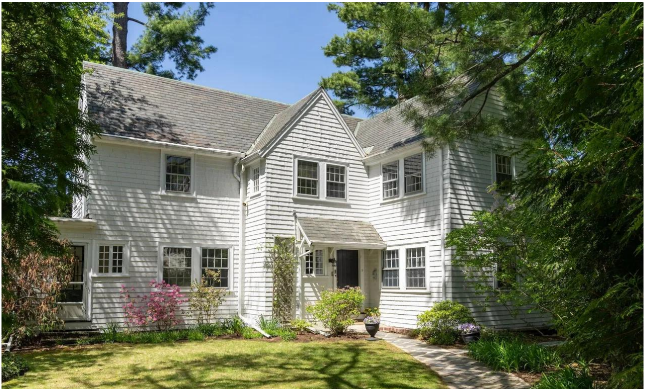
9 Wyman Road.