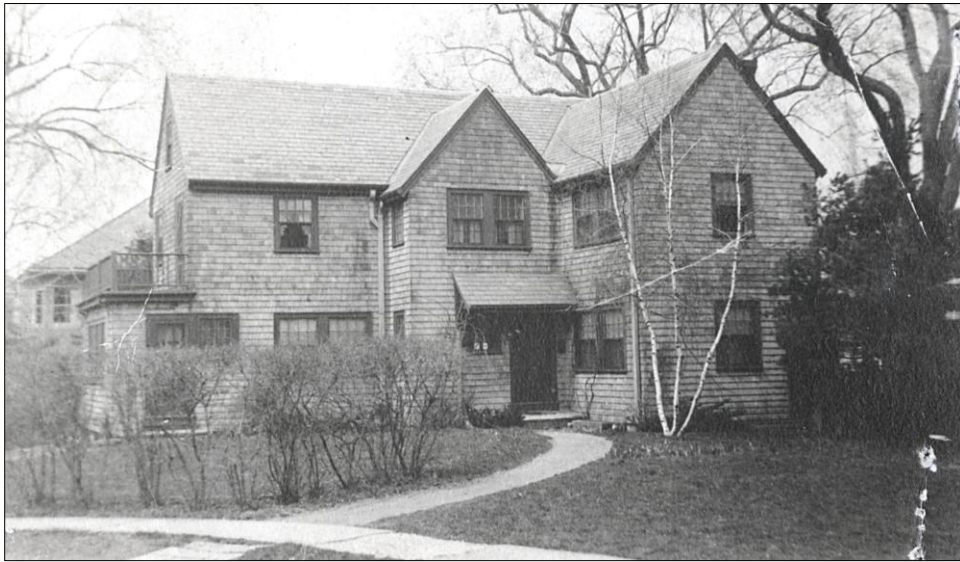
9 Wyman Road in 1956