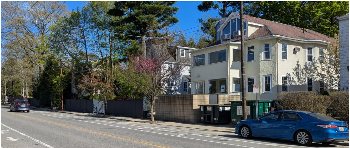
L-R 5 Wyman Road, 9 Wyman Road, and 234 Huron Avenue