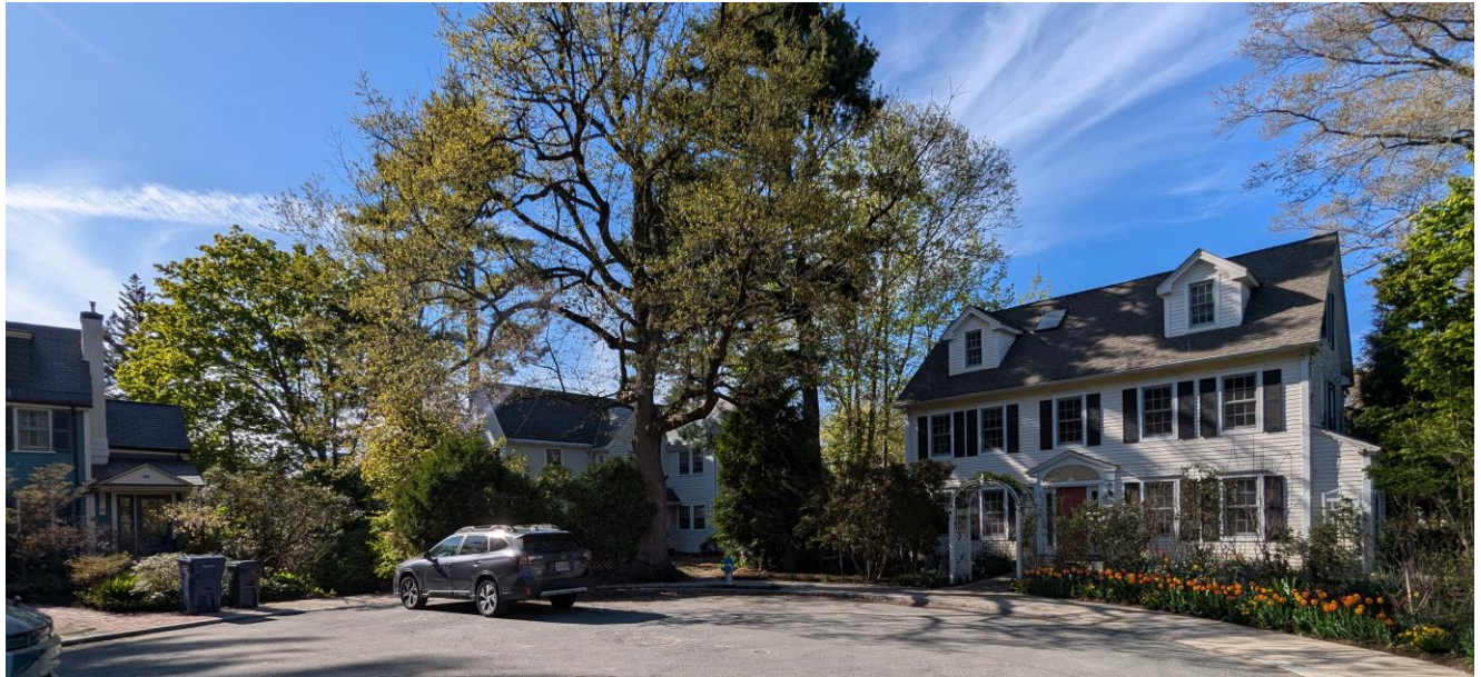
R-L: 5 Wyman Road (1926), 9 Wyman Road (1927) and 14 Wyman Road (1927), all by Duguid & Martin CHC 2026