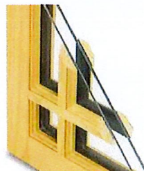
Simulated Divided Lite (SDL)