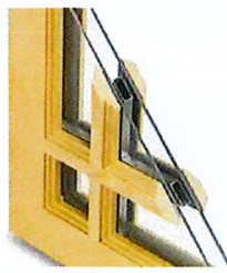
Simulated Divided Lite with Spacer Bar (SDLS)