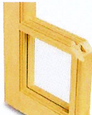
Authentic Divided Lite (ADL)

Simulated Divided Lite with Space Bar (SDLS) - Paired with SDL bars on the interior and exterior of the glass, a spacer bar is installed between the glass, creating an even closer resemblance to the ADL look.