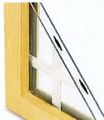
Grilles Between the Glass (GBGs)