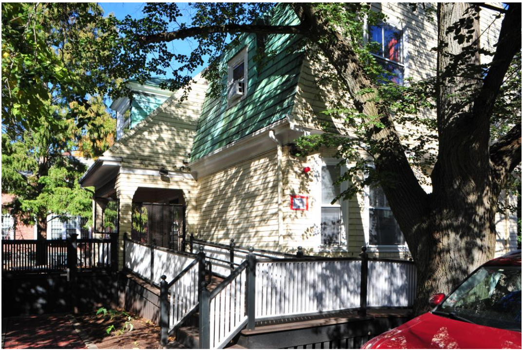
4 Buckingham PI., CHC staff photo, November 2021.

The Thackray-Kelsey house at 4 Buckingham Place is a 2½-story Queen Anne cottage built in 1892 as a single-family residence. The house measures 27 x 28 feet. The roof is steeply pitched and clad in copper. The roof extends down over the entrance porch, located on the west elevation. Three shallow shed dormers are located on the east side and one on the west. A brick chimney is located at the center of the house. The walls are clad in cedar shingles painted yellow. The second-floor projects about one foot over the first floor and rests on exposed beams. Under it, a three-sided bay occupies the left side of the street-facing elevation. A handicap ramp wraps the building on the south and west sides. The windows are a mixture of original and replacement sash but were originally a combination of two-over-two double-hung sash and diamond pane casements. There have been no additions to the original mass of this compact cottage.