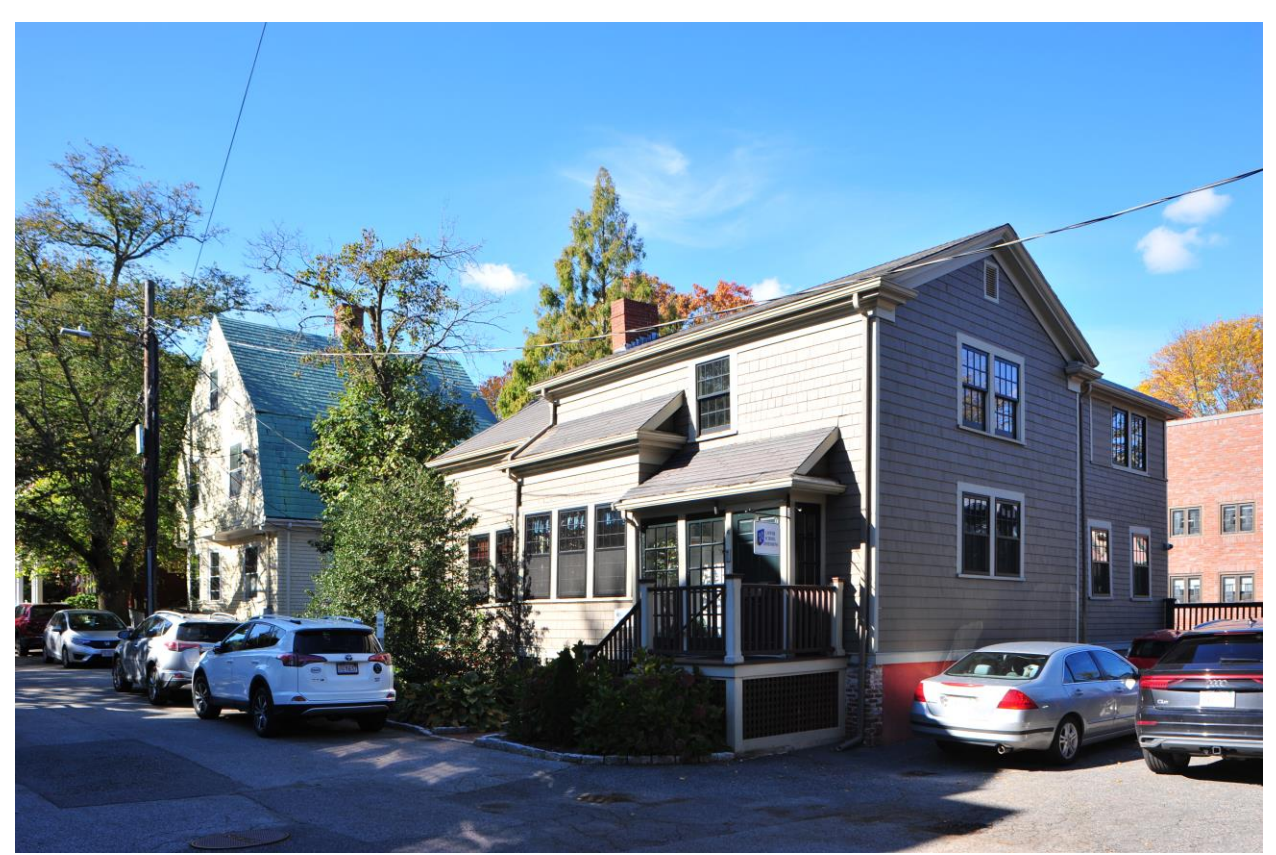
South and east elevations of 6 Buckingham PI. Two-story addition at right. Nov. 2021.