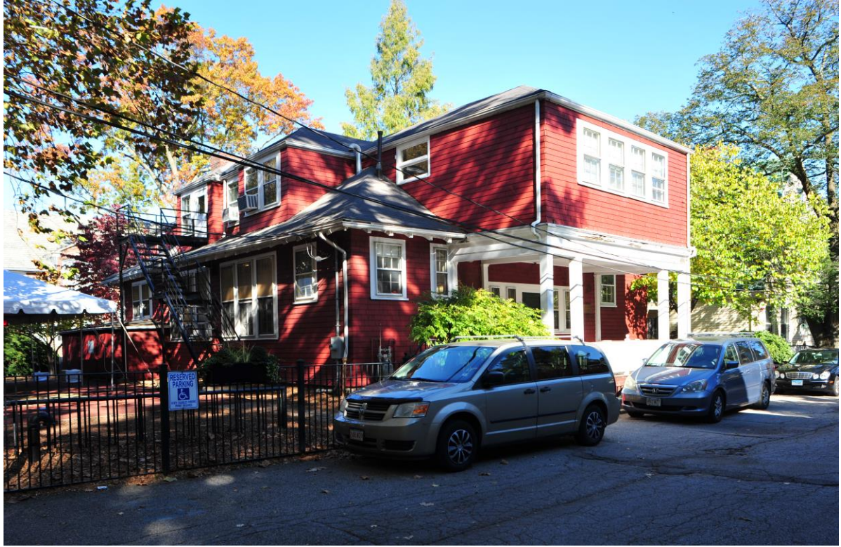
West and south elevations of the Markham building at 10 Buckingham St. Nov. 2021.