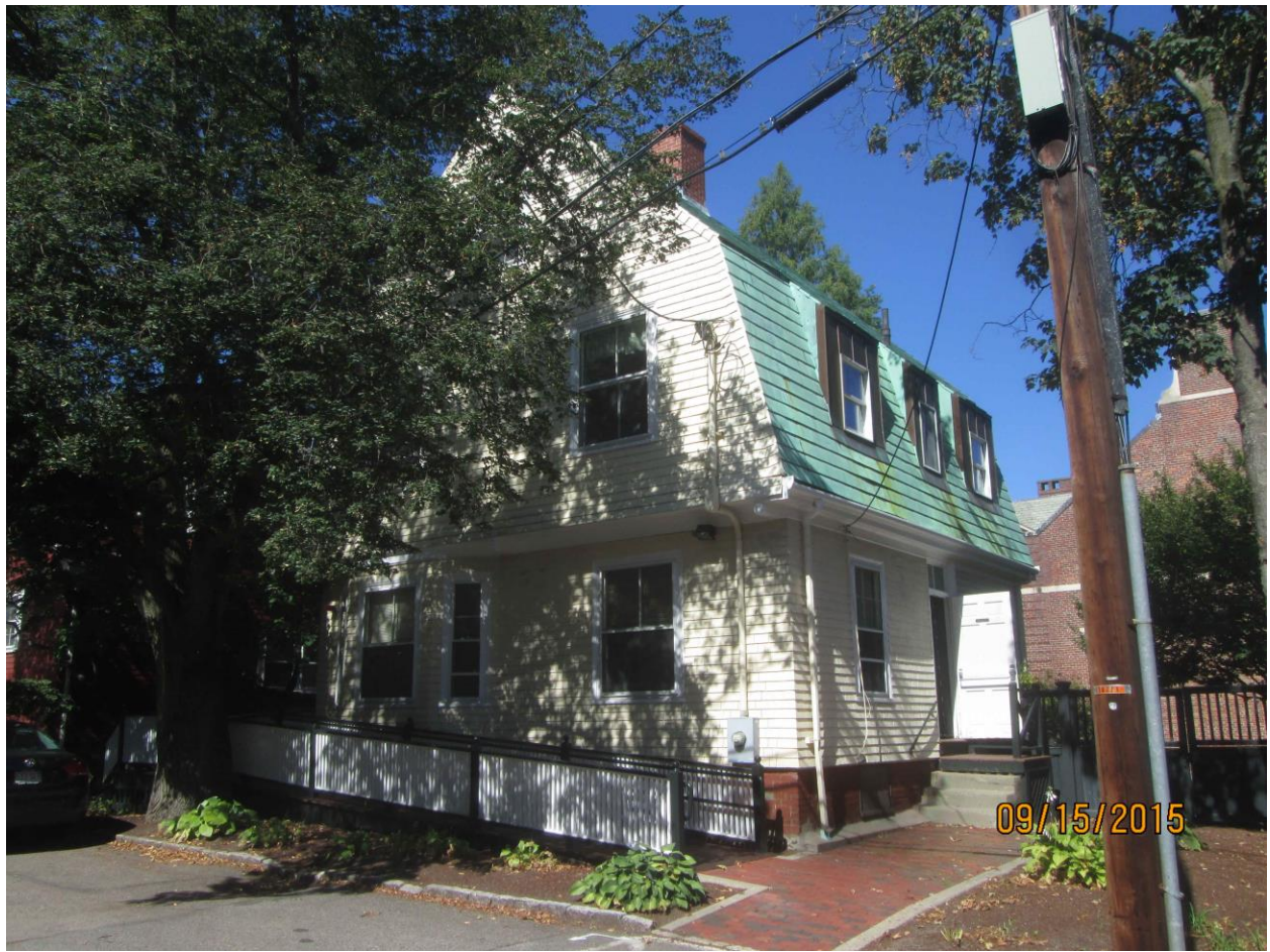
4 Buckingham Pl., Assessor's photo 2015