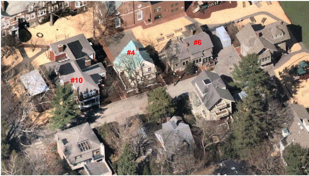
Aerial view 27 March 2021.