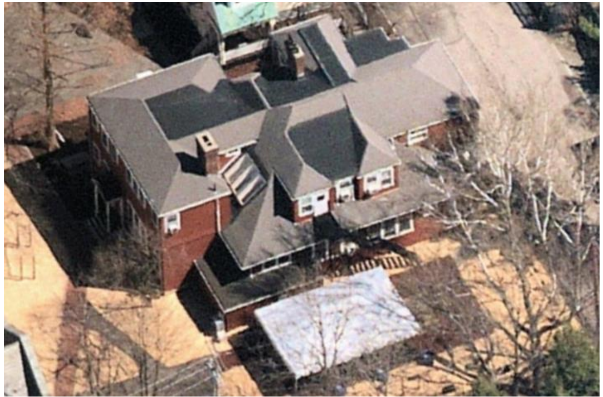
Aerial view of the Markham building, 27 March 2021.