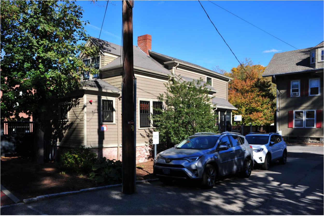
West and south elevations of 6 Buckingham PI. CHC staff photo, Nov. 2021.