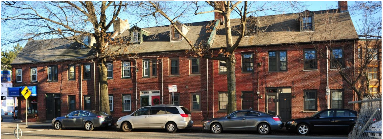
Bottle House Block, 204-214 Third Street (1827)

If adopted, the City Manager would appoint a commission comprised of East Cambridge residents and property owners to review applications for new construction, demolition, and alterations on properties within the district. Demolition and new construction would always be subject to review; decisions on alterations would be either binding or non-binding based on the scope of work and whether the property is listed on the National Register of Historic Places (see map).