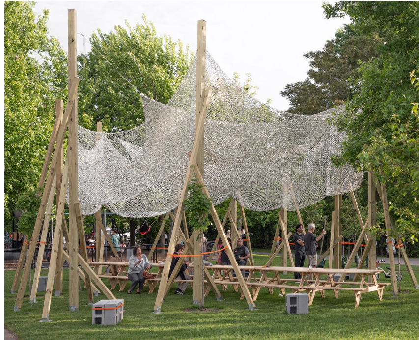
Growing Shade, Russell Field 2024