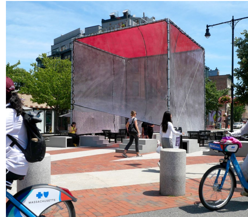
Sunblock, Central Square 2024-2025