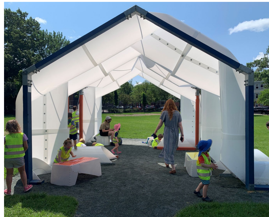
CloudHouse, Green Rose Park 2021-2022