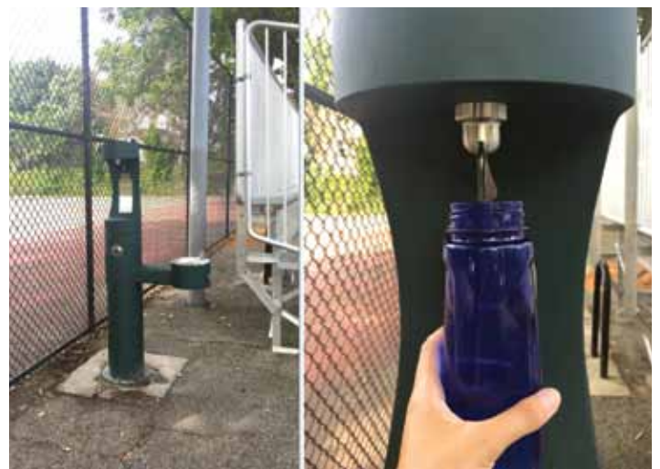
Water bottle fill stations were installed as part of a prior winning PB project.

$1 million of the City's FY21 capital budget. Idea collection on projects to improve Cambridge will take place from June 1 - July 31, 2019 and voting will be held in December. Learn more at Pb.CambridgeMA.gov .