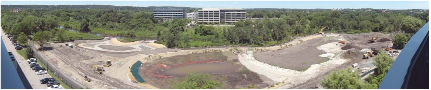
The city's engineered wetland was integrated into state conservation land and sensitive habitat.

separation of the CAM 004 combined sewer system along with partial separation of adjacent CSO areas. Several phases of conventional infrastructure projects were envisioned over a 20-year span, but the plan did not mitigate existing flooding in CAM 004 and had the potential to exacerbate flooding in the Alewife Brook with newly separated stormwater.