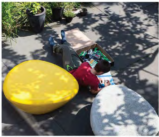
Sculptural/playful objects can captivate childen while also serving as additional seating elements