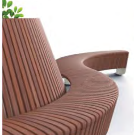
A sculptural bench with under lighting can serve to unify the elongated space while adding visual interest