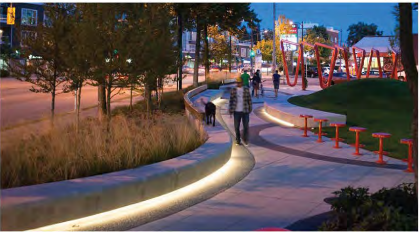
A sculptural bench with under lighting can serve to unify the elongated space while adding visual interest