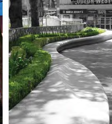
A sculptural bench with under lighting can serve to unify the elongated space while adding visual interest