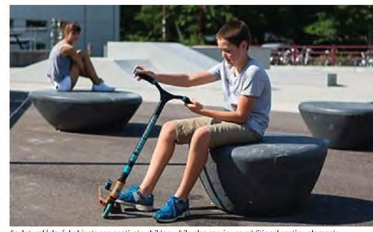
Sculptural/playful objects can captivate childen while also serving as additional seating elements