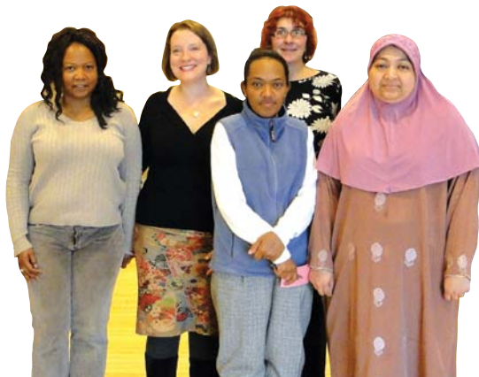
Community members gather to discuss Report data.

For more information or to download a PDF of the entire report, please visit www.cambridgewomenscommission.org or call 617-349-4697. ■