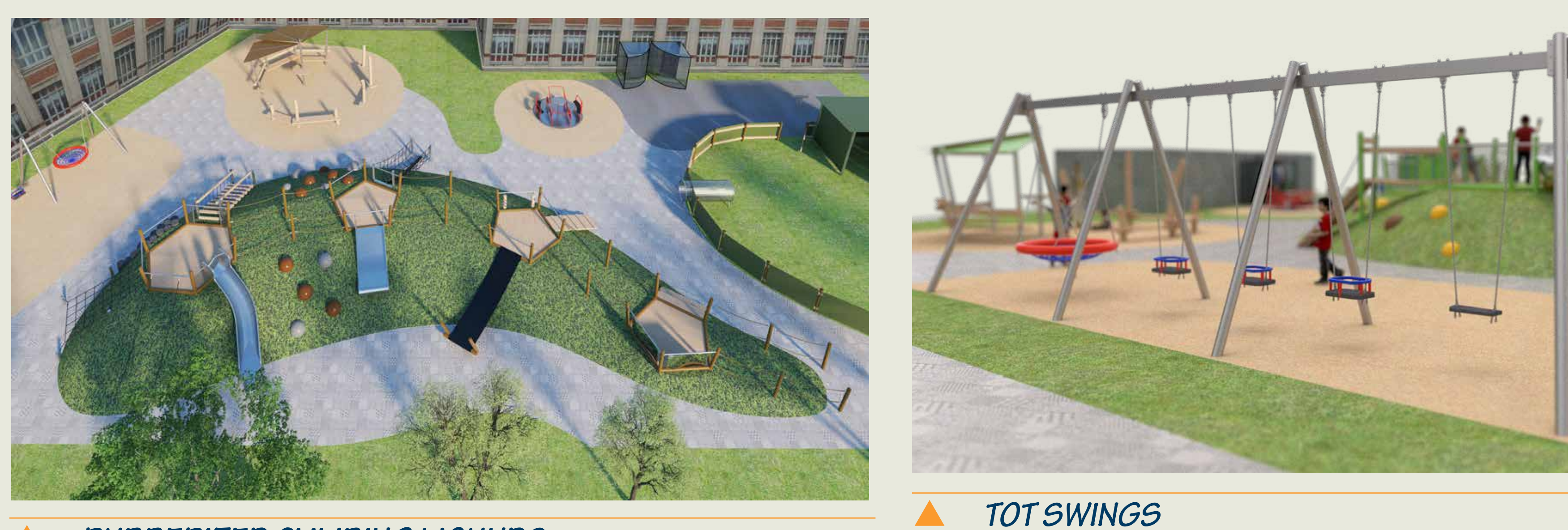
RUBBERIZED CLIMBING MOUNDS