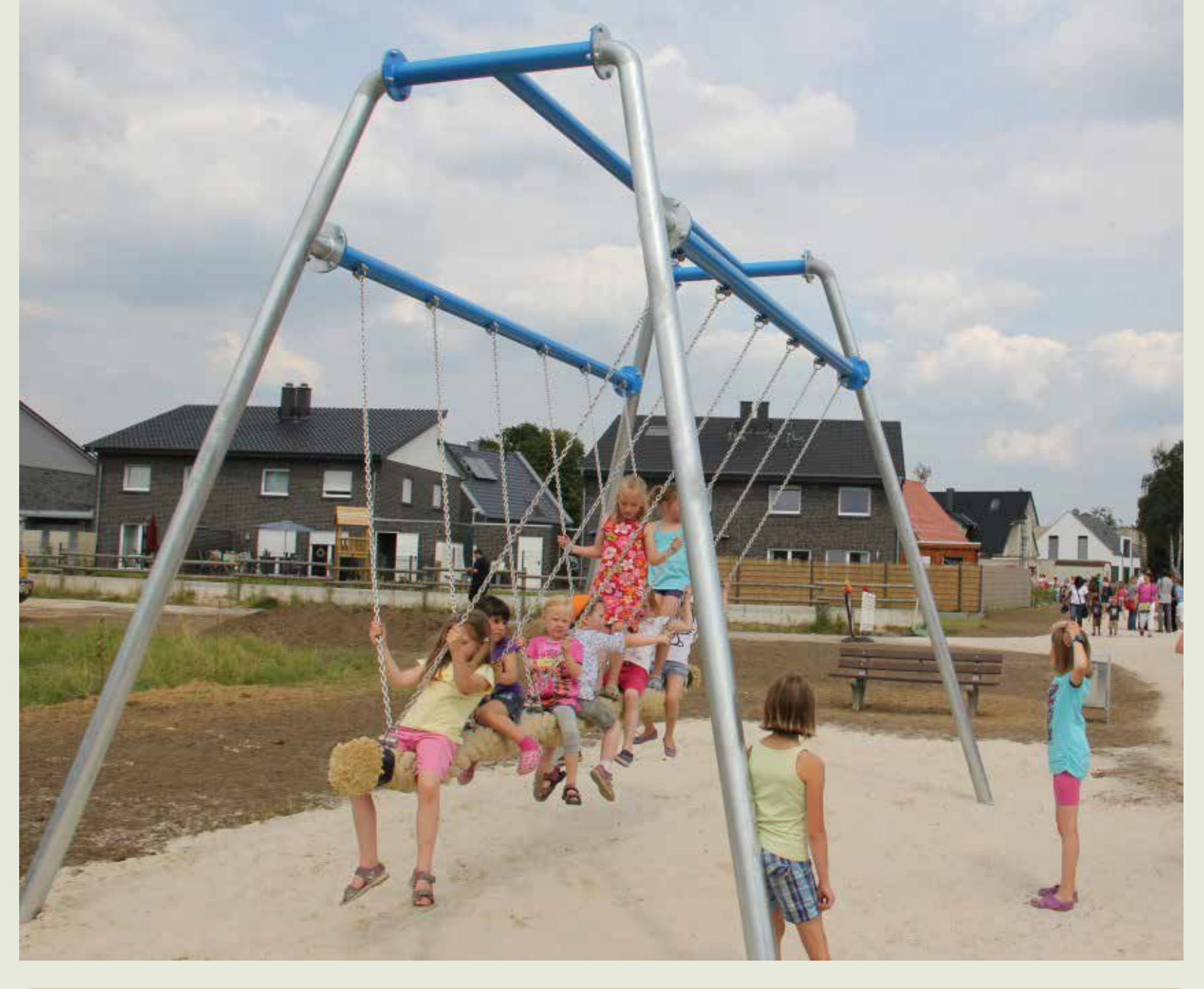
"VIKING" GROUP SWINGS