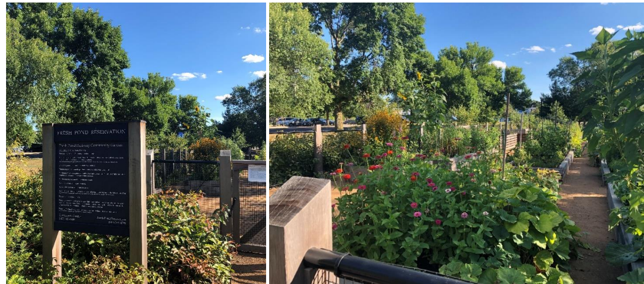
Fresh Pond Community Garden