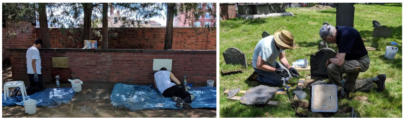
Old Burying Ground in Harvard Square – Tomb Repointing (left) & Headstone Mending (right)