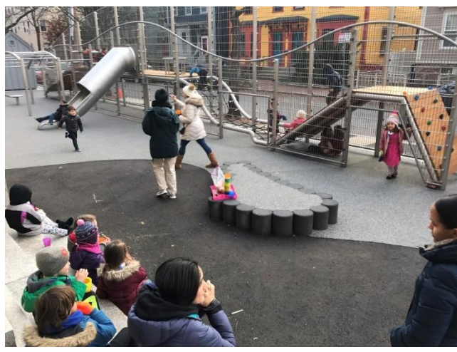
Amigos School Playground Renovation