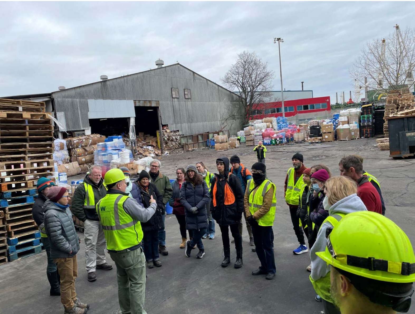
WM CORe pre- processing Tour