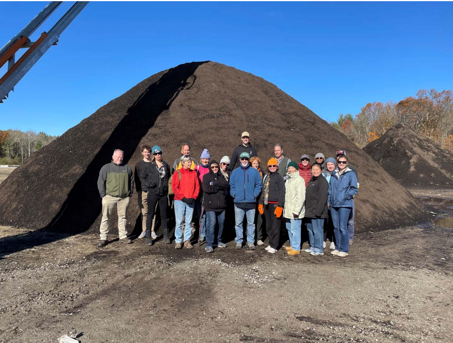
Yard Waste Tour—West Bridgewater