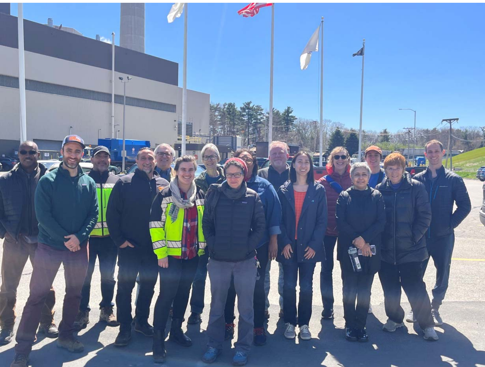
Covanta Incinerator Tour