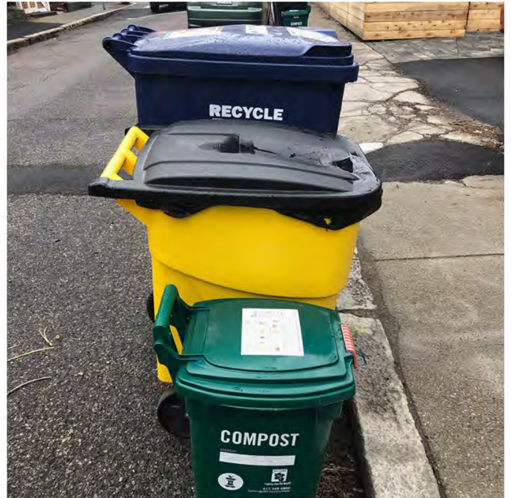
Cambridge has curbside recycling and composting in addition to trash pickup.

Cambridge residents have reduced the amount of trash they throw out by 20%