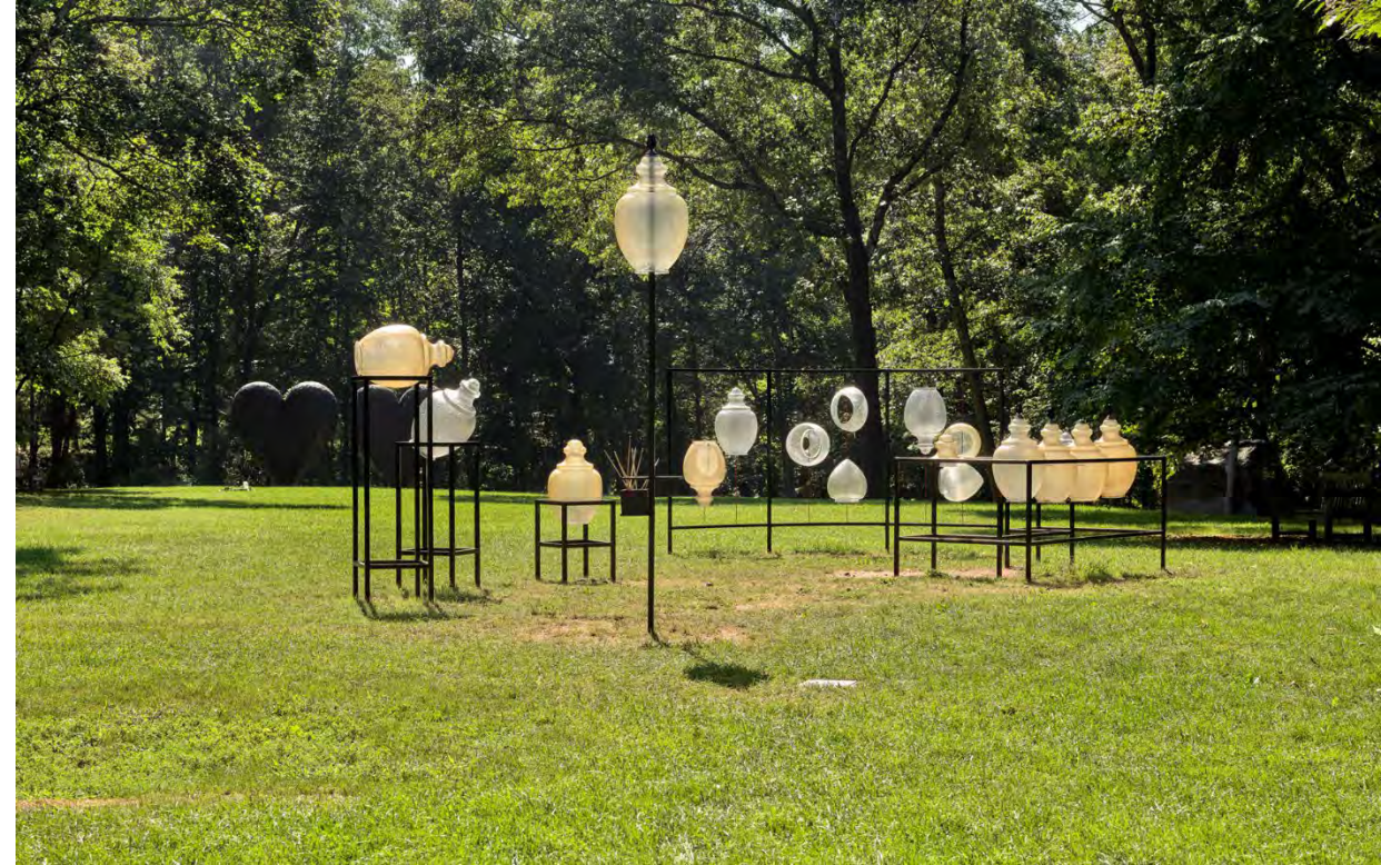
“City Lights Orchestra” —was on view at the DeCordova Sculpture Park and Museum in 2019-2020