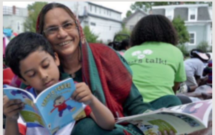
Department of Human Services Book Bike Program