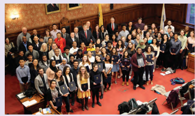
2019 Scholarship Recipients

In 2021 the City awarded 80 scholarships of $3,000 each for a total of $240,000 to Cambridge high school seniors and others pursuing higher education. Since the programs inception in 1993, the City has awarded 1,188 scholarships totaling $2.9 million.