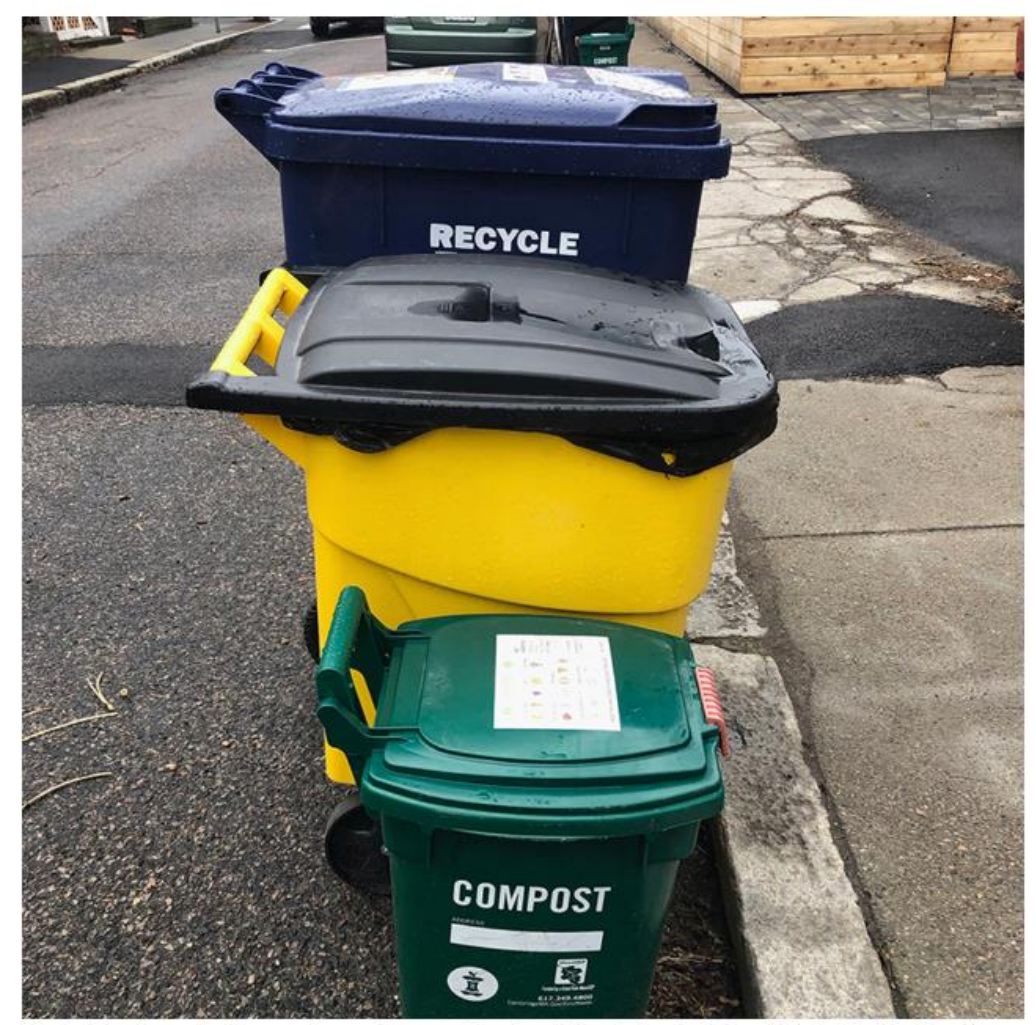
Cambridge has curbside recycling and composting in addition to trash pickup.

Cambridge residents have reduced the amount of trash they throw out by ac-