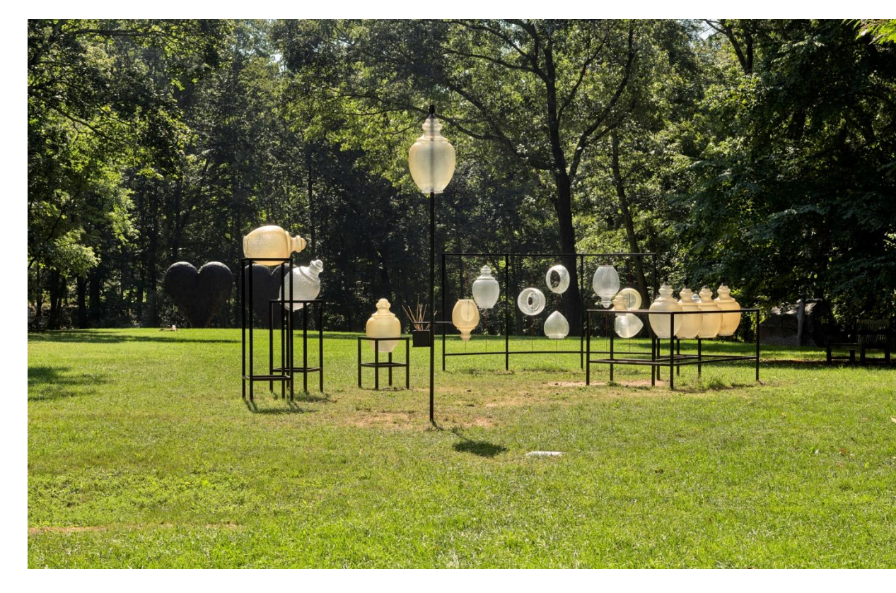
<u>"City Lights Orchestra"</u>—was on view at the DeCordova Sculpture Park and Museum for 1 year