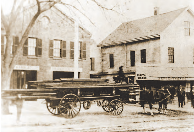
CHC. Courtesy Christian Mission Holiness Church.

Built in 1852, it was the largest of the city’s three fire stations and is now the oldest intact firehouse in Cambridge. When a new fire station was built in Lafayette Square in 1894, the old building passed through a series of owners until purchased by the Christian Mission Holiness Church in 1916.