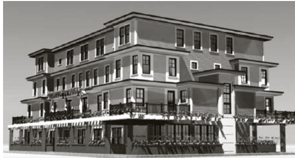
823 Main Street Just A Start Corporation

For more information about recycling in Cambridge, please visit www.cambridgema.gov/theworks