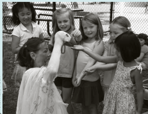
Arts Council's Summer in the City performance by Mystic Paper Beasts