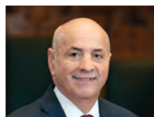
The City Manager's Message in Multiple Languages Pages 3, 6-7