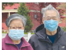
Get Your COVID-19 Vaccine Today Pages 4-5