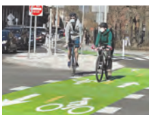
FY22 Budget Key Initiatives Pages 2-3